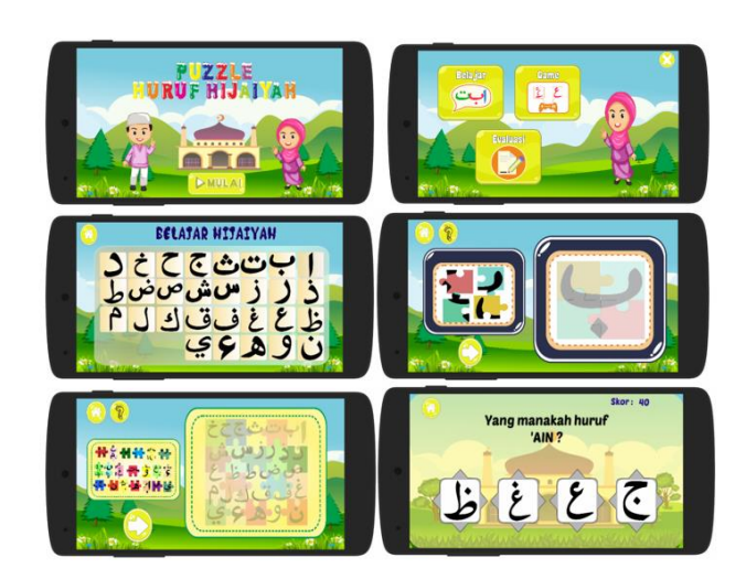
Figure 3. Mobile Puzzle Games for Learning Hijaiyah Letters

The evaluation was carried out to find out whether the Hijaiyah letters learning puzzle mobile game application that had been developed met the needs. The evaluation was carried out using a multimedia quality test. The Multimedia Quality Test was conducted by kindergarten teacher Salman Alfarisi and a multimedia expert. The number of respondents in the multimedia feasibility test was 5. After the respondents tried the application, they were then asked to rate the application according to the statements in the questionnaire. Each statement can be rated in the range of 1 to 5 according to the perceptions of teachers and multimedia experts. Table 2 shows the results of multimedia quality testing.