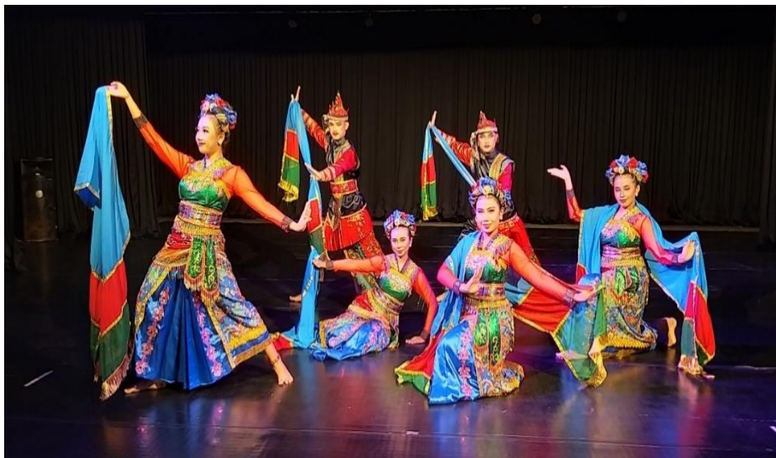
Fig. 1. Suramadu Dance Image

Suramadu Dance is a dance created by Diaztiarni which was created in 2009. Suramadu Dance is the title of a dance which is associated with a bridge connecting Java Island with Madura Island, the Suramadu Bridge, which can now be said to be an icon of East Java as show in Fig. 1. This bridge can facilitate transportation, the economy and all areas of life between communities in the two areas. The Suramadu Dance is a dance work resulting from a collaboration of music and dance movements from the Surabaya and Madura regions, which depicts the joy and enthusiasm with which the people of Surabaya and Madura welcome tourists visiting the area.