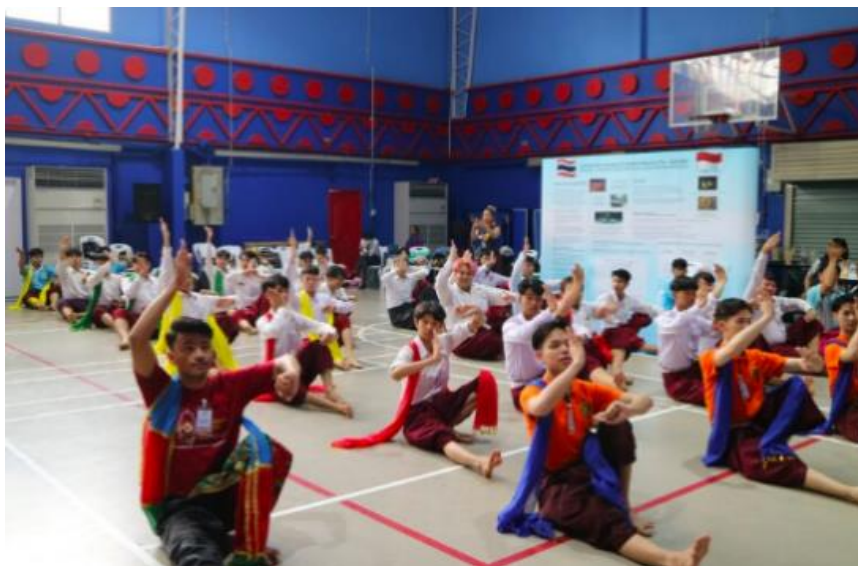
Fig. 2. Trainer Demonstrates Dance Movements and Trainee Imitates

The demonstration method in dance training is a very effective method because it involves the use of concrete examples of the Suramadu dance so that training participants can imitate and demonstrate the Suramadu dance movements well. The steps for implementing the training include several activities, namely: