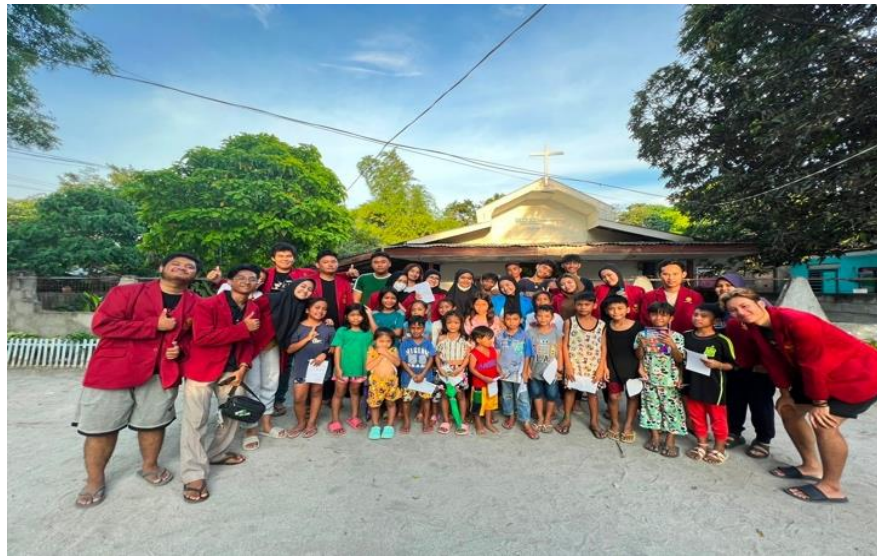
Fig. 2. Participated kids

Beyond just knowledge transfer, the Community Service students agreed that giving incentives to participating children would increase their willingness to engage more which was shown on how those Quilantang youngsters indeed left with a very upbeat and enthusiastic attitude. Following this activity, the children and teenagers that were participating in the teaching-class gained information and a lot of things learned about their ancestors land, proven by the fact that during the quiz session conducted at the end of the class, the participating youngsters were eager to answer the questions which some of them got it correct. List question show as Table 1 .