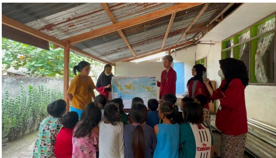
Fig. 1. Indonesian Folklore Teaching-Class

Starting at Sunday, August 14th, 2022, the teaching-class of introducing PIDs children to Indonesian language and folklore was carried out. The Quilantang ICCP Church was the location of this activity and it took place mostly in the afternoon for around one to two hours. The Community Service students had notified the Quilantang youngsters, in advance of the Indonesian language teaching activity, that there would be an Indonesian language teaching activity on the next day. The amount of children who came to this Indonesian teaching class was around 10 to 15. This number fluctuated since some of the children had school. In the first and second week, the Community Service students were providing the children with a map of the state of Indonesia and educating them on the names of the provinces in Indonesia as well as the folk stories that were associated with each province. On each day, two folklores were introduced. After being instructed in folk stories, children staged a speech to review the stories and the Community Service students asked them to tell what they had learned from the stories. Folklore teaching class show as Fig. 1.