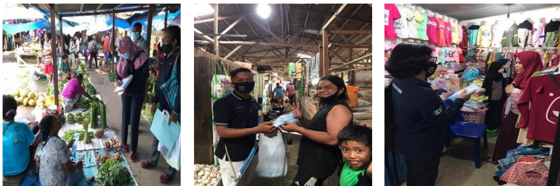
Fig. 3. Distributing masks to traders of vegetables, basic necessities and clothing

This activity is in accordance with the presentation of health protocols by the Minister of Trade that health protocols must be applied in people's markets, both modern and traditional markets. One of these health protocols is the use of masks. The use of masks is intended to avoid and reduce the spread of the coronavirus (Covid-19) [12]–[14]. The implementation of health protocols by distributing masks to market traders has also been carried out in traditional markets [15]. Thus, it is hoped that the manager of the people's market must ensure that all traders wear masks during their activities.