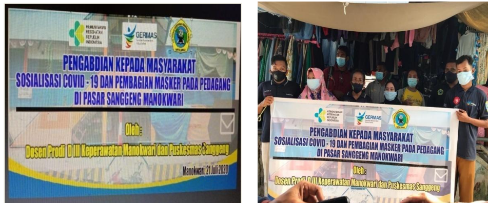
Fig. 2. Activity banner