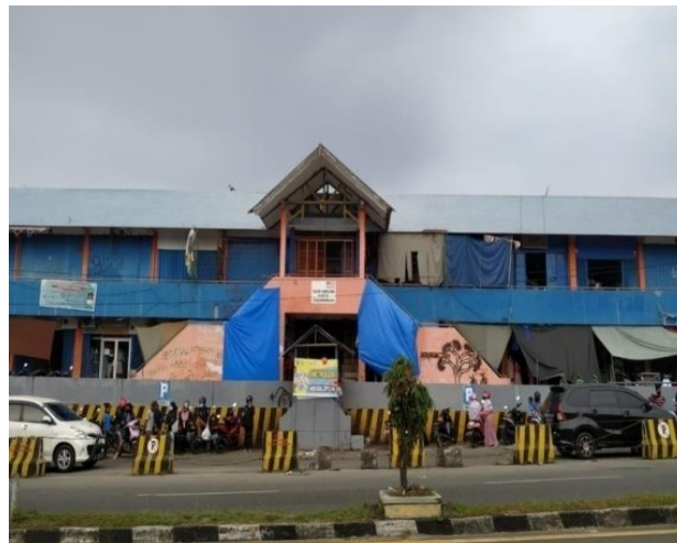
Fig. 1. Sanggeng Manokwari Market

Community service activities are carried out by providing health information about the corona virus and distributing masks to traders at Sanggeng Market. Sanggeng Market is one of the traditional markets located on Jl. Yos Sudarso, with an area of 11,563 square meters. The location of the activity was chosen based on the observation that most traders do not wear masks. Merchandise sold in the form of groceries, vegetables, clothing, electronic, shoes, and bags. The activities run well and smoothly. The targets of this activity are traders at the Sanggeng market, they respond well to the activities carried out.