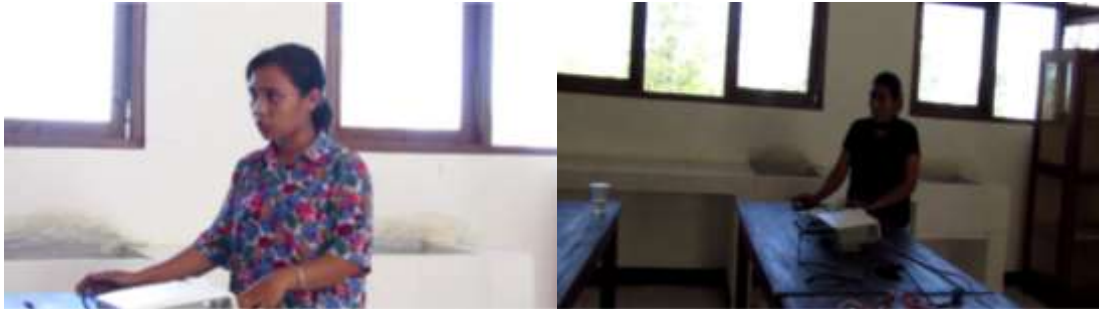
Fig. 4. Participants discuss the outcomes of the integrated scientific learning design to mentors.

After giving the pretest, the material is given by the speaker. The material given is an understanding of integrated science at the junior high school level. MIPA teachers at partner schools attended this activity, and several MIPA teachers from other schools around the partner schools participated and took part in the activity, considering the material presented was very needed by local teachers. Some of the Mathematics and Natural Sciences teachers who participated in this activity were from SMP N 1 Nekamese, SMP N 2 Nekamese, SMP N 4 Nekamese and SMP N 5 Nekamese. During the presentation of the material, the participants seemed quite enthusiastic about participating in the activity, Figure 4 .