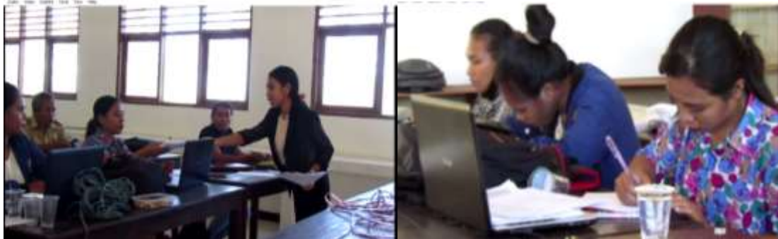
Fig. 5. The participants are working on posttest questions.

Before the activity begins, they have prepared the place for the activity and the equipment that will be used. In the process of the activity, the participants were also active in asking the speaker regarding the things they did not understand or the problems they had experienced during the teaching and learning process. Here is some of the documentation we took during the activation process on Monday, August 10, 2020, until the activity was finished, Figure 5 .