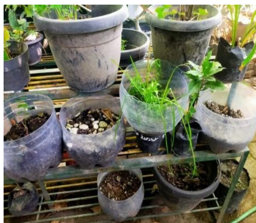
Figure 4. Utilization of gallon waste

The reuse of Muhammadiyah Karangkajen 1 Yogyakarta uses catered lunches using lunch containers that can be washed again. Students who are not catered can bring their lunch or buy food in the canteen. Food in the canteen uses plates Can use Again. So, drinks, sellers provide glasses, plates, spoons, and other cutlery that can be washed again, thereby reducing the use of single-use items. Regarding recycling, waste is not immediately thrown away but is reused into something useful. At SD Muhammadiyah Karangkajen, SD Muhammadiyah Karangkajen uses used waste such as bottles or gallons of mineral water to make plant pots. You can see it in the greenhouse or front of the class.