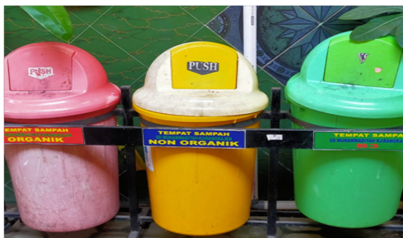
Figure 2. Organizing waste according to categories

Based on the results of the interview, the 3R program has been implemented at SD Muhammadiyah Karangkajen. This is also shown by documentation data obtained in connection with research which shows that waste management is starting to be well coordinated through the provision of facilities and infrastructure such as waste bins according to categories (See Figure 2).