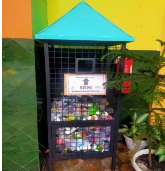
Figure 3. Bottle donation box

minimize the use of single-use items because the waste they have is taken home. Plastic bottles are not taken home because SD Muhammadiyah Karangkajen provides charity boxes in the form of plastic bottles which can be used for other things.”