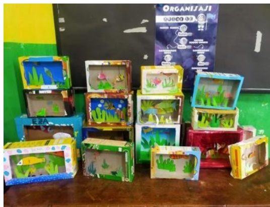
Figure 5. Waste is processed into a medium for channeling creativity

we do, namely the use of cardboard or paper waste. We collect it in sacks that have been provided in each class to be used as handicraft materials or class decorations so that the paper waste has benefits. has benefits for decoration and does not become waste. "These activities are familiarized through the culture and rules implemented by the school, and the embodiment of the vision and mission created by our school.