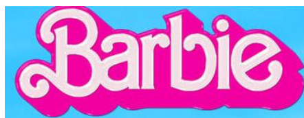
Fig. 2. Typography in Barbie posters . Source: (Ekeleme, 2023)

The image above is the official poster image for the Barbie film which has been broadcast and has so many fans at all ages. This image has something unique and interesting in terms of writing, color, and the arrangement of the elements in it. This official Barbie film poster contains visual elements. Some of the visual elements that researchers found through the poster are: (a) typography; (b) Visual Objects; (c) Color; (d) Layout.