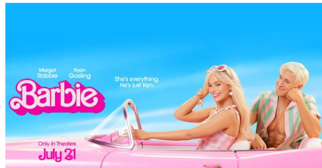
Fig. 1. Barbie Official Poster.

2023). This Barbie movie tells the story of Barbie's perfect life living in Barbie Land until one day Barbie experiences strange things that make her have to leave Barbie Land and decide to enter the human world. But when Barbie left Barbie Land it turned out that Ken followed her too. From here, Barbie and Ken's adventure begins.