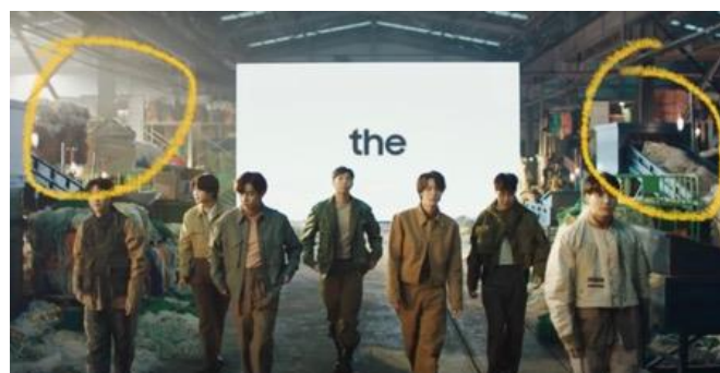
Fig. 5. The icon in the Samsung x BTS ad: Galaxy for the Planet ( youtube.com/SamsungUS )