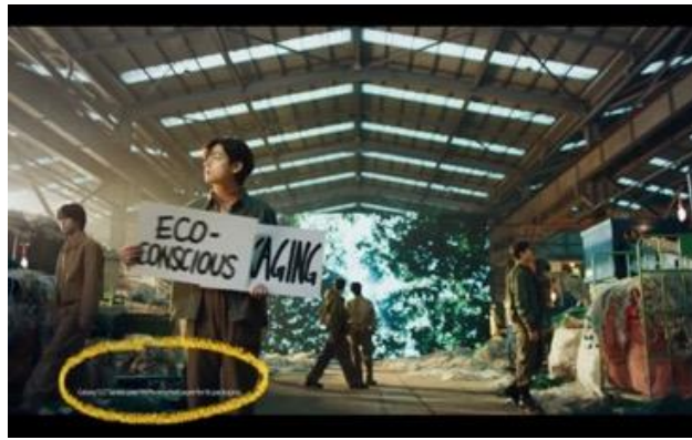
Fig. 6. The icon in the Samsung x BTS ad: Galaxy for the Planet ( youtube.com/SamsungUS )