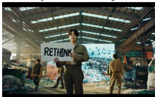
Fig. 3. The third index of the Samsung x BTS : Galaxy for the Planet ads ( youtube.com/SamsungUS )