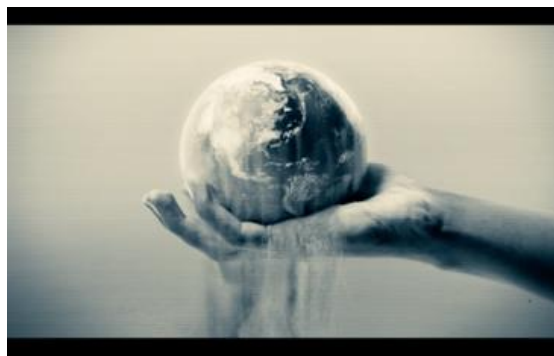
Fig. 7. The first symbol in the Samsung x BTS ad: Galaxy for the Planet ( youtube.com/SamsungUS )

A symbol is something that is accepted by the public or by mutual agreement (Sakinah, Alfiqri, 2020). With this the relationship between the symbol and object is a conventional relationship. The first symbol is a hand holding a sphere that looks like the earth, and there is sand falling because it is being eroded, depicting the earth which is slowly starting to experience a crisis due to global warming (Ibrahim & Sulaiman, 2020).