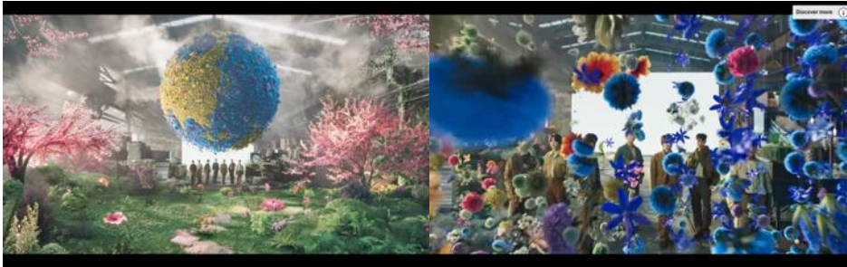
Fig. 9. Symbols of various kinds of flowers that are make up the earth and various kinds of plants

Kaufman, 2022). Here is why flowers can be symbolism of beauty. Most of the various types of flowers are represented as beauty. For example, the amaryllis can symbolize splendid beauty, calla lily symbolizes magnificence and beauty, and more flowers represent beauty. A lot of people use flowers to refer to beauty for their special person (Pan et al., 2020).