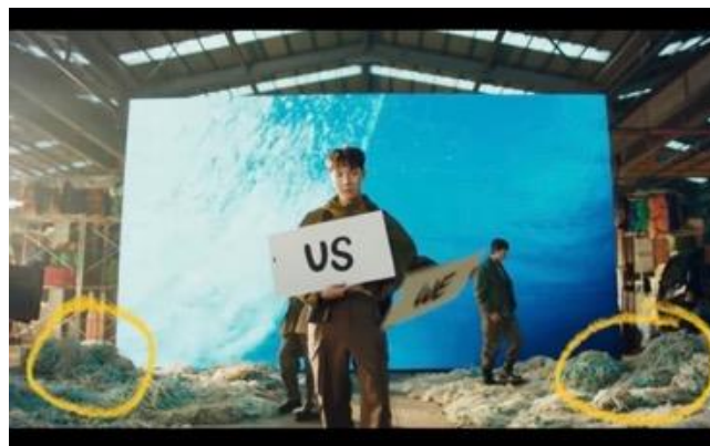
Fig. 4. The icon in the Samsung x BTS ad: Galaxy for the Planet ( youtube.com/SamsungUS )

According to Representant (R), Interpretant (I), and Object (O) then, these ads can provide some understanding for the audience. Logically choosing the character of a brand ambassador also considers several aspects for the advertising model, namely, an attractiveness, expertise, and trustworthiness. In this case BTS has entered into all aspects to model an advertisement (Dweich et al., 2022).