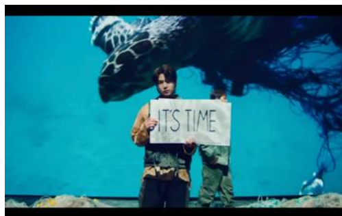
Fig. 2. The second index of the Samsung x BTS : Galaxy for the Planet ads ( youtube.com/SamsungUS )