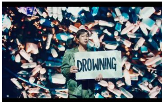
Fig. 1. The first index of the Samsung x BTS ad: Galaxy for the Planet ads ( youtube.com/SamsungUS )

Index Index is a sign that is casual and has a connection to what it represents (Rizki et al., 2020). Having a relationship with an object that has cause and effect, or the result of a message (Fabianti & Putra, 2021). For example of indexical in the Samsung x BTS: Galaxy for the Planet advertisement are, in the first picture you can see the BTS member who is the leader of the group carrying a paper containing a message that the sea is full of plastic waste, besides that when he brings the paper there is also a screen behind him, in which describes the current condition of the ocean filled with plastic waste (pic no. 1). In the second picture, the rapper from the BTS group also carries a paper with a message that marine animals are being affected by plastic waste in the ocean, and on the screen there is a sea turtle entangled in fishing net garbage which is a bad impact for other animals too, not only sea turtles (pic no. 2). Then in the third picture, there is a vocalist from the BTS group who brings a paper with a message to rethink about the life of a product, by showing a video behind the screen there is product garbage piling up, most of what is shown is garbage that is just left piled up until trash to be recycled (pic no. 3). Everything that is displayed on the screen when the members bring paper with the message is the reality experienced by the earth as well as around the current environment.