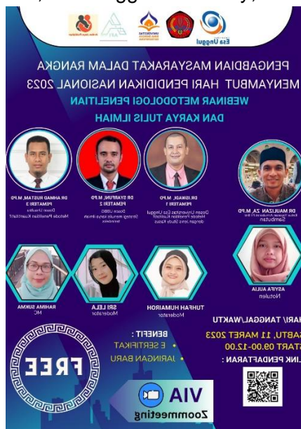
Figure 2. Flyer of Webinar

observation activities carried out at this preparatory stage, it can be described that all important preparatory activities carried out by the webinar activity committee are more focused on realizing webinar activities by presenting performance as well as the best infrastructure to all existing participants, even though the activities are carried out online. Below is one of the infrastructures in the form of a poster as the main source of information from the webinar activity "Research Methodology and Scientific Writing" by the committee and the entire academic community of the Faculty of Communication Sciences, Esa Unggul University, Jakarta.