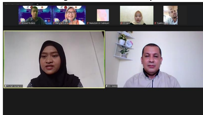
Figure 4. Webinar Activity

Referring to the explanation of the material discussed or conveyed by the speaker above, if it is correlated with the conditions of the students of the Faculty of Communication Sciences, Esa Unggul University Jakarta in particular, it is certain that the conclusion will be obtained that the material is quite crucial and is indeed completely important for students to digest. Materials for writing research papers, ranging from case studies to statistics, can help students to be more aware of the phenomena of communication around them, which, if considered in detail, become increasingly complex over time [12]. Communication patterns in the current generation will be different from previous generations [13] and these changes can be studied specifically and packaged as interesting cases. Some of the other materials above are also definitely related to the provision of students to do PPL, community service and journal writing as a final assignment that they will do.