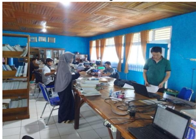
Figure 2. Activities for Adding Book Collections to SLiMS.

The implementation of service activities is carried out at the library unit of the Pagar Alam Institute of Technology by providing knowledge on the use of SLiMS application users through presentations, discussions, and training. The presentation was made to provide knowledge about the features of SLiMS in processing the circulation of book collections and user data. The training carried out for librarians is shown in Figure 2.