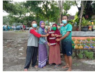
(d). The completion of vertical garden training (Group 2)