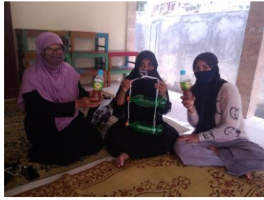
(c). The completion of vertical garden training (Group 1)