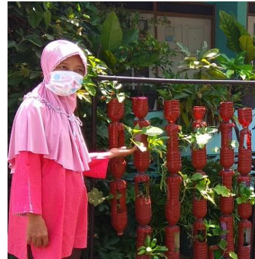
(f). The vertical garden becomes a fence