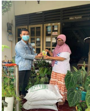
(e). The hand-over of training material