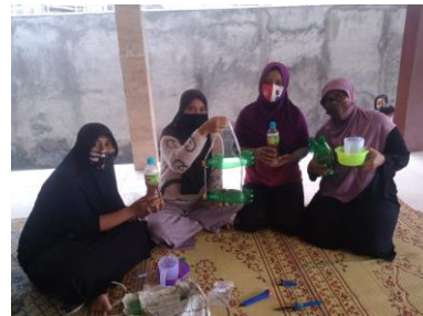
(b). Non-organic Waste Utilization Training