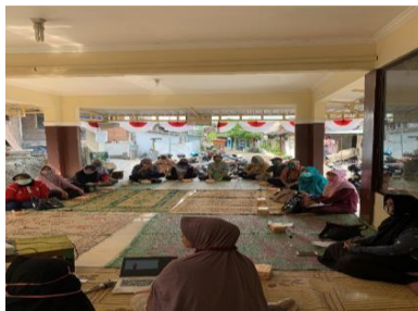
(a). Counseling on the use of non-organic waste