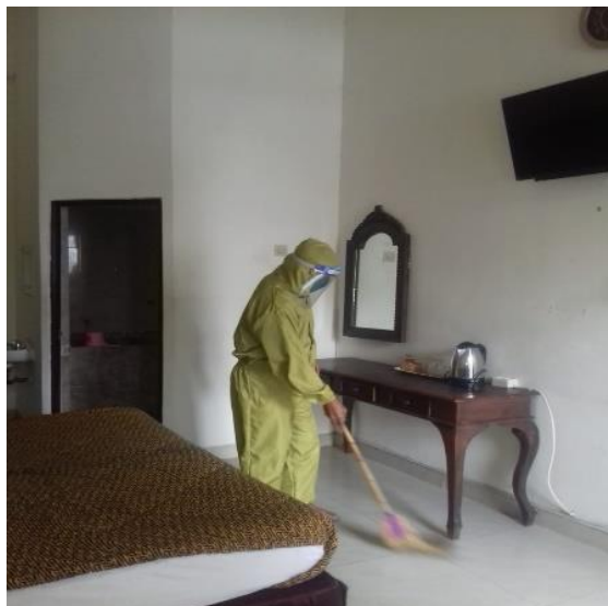
Figure 4. Room cleaning demonstration in the indoor

At the same time, health protocols are also demonstrated for guests who will come and visit hotel environment. Figures 5 and figure 6 show the health protocol that was implemented at Laweyan Hotel.