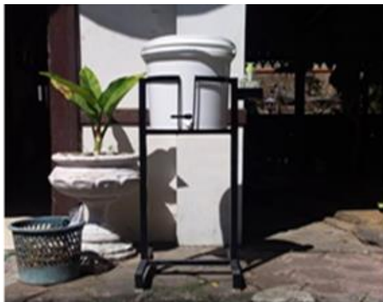
Figure 6. Hand Washing Point