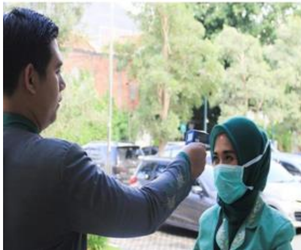
Figure 5. Body Temperature Detection