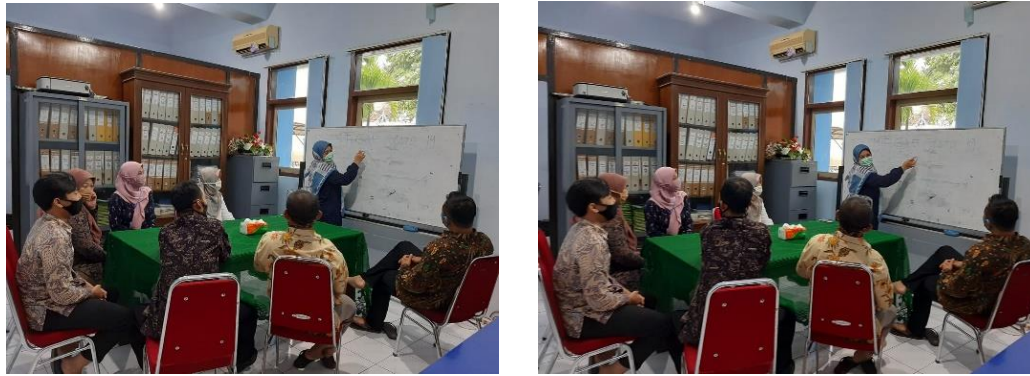
Figure 7. FGD Process