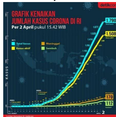
Figure 1. Covid-19 Outbreak Graph in Indonesia.

In Indonesia, the Covid-19 virus has been infecting since March 2, 2020. Furthermore, an overview of the spread of Covid-19 to date can be seen through the following graph as cited from the Ministry of Health of the Republic of Indonesia.