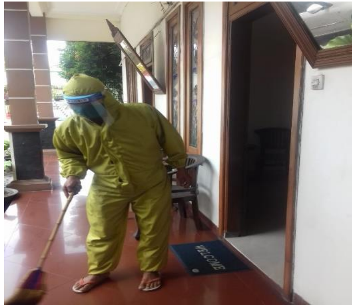
Figure 3. Room cleaning demonstration in the outdoor