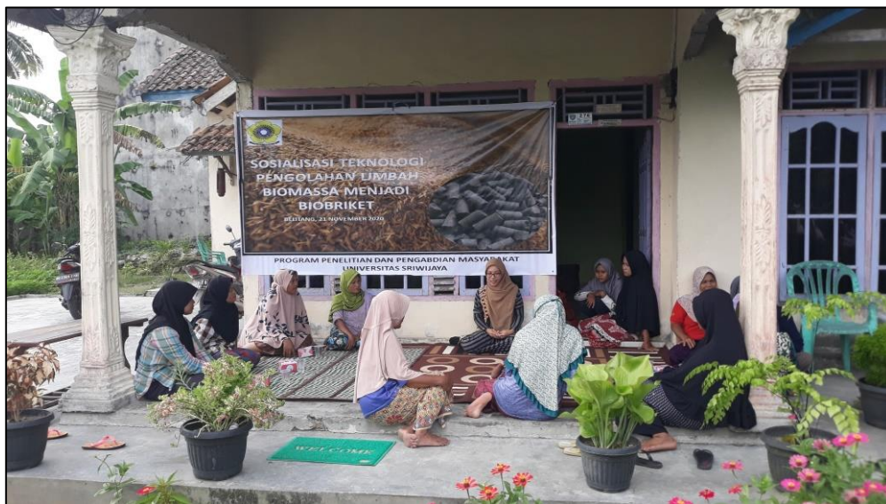
Figure 3. Outreach activities to the community

Socialization activities regarding briquettes to the community in Karang Kemiri, Belitang District were carried out simply in one of the local houses by studying the updated situation of the COVID-19 pandemic. To avoid crowds, the socialization stage was only attended by 10-15 people (Figure 3). The presented socialization topics consisted of background, benefits, working procedures with capital calculations to briquette production. The material was delivered by the working team under 45 - 60 minutes followed by discussion. The socialization material also provided a simple calculation of initial capital for making briquettes to the public. This was done so that the community has an idea and motivation to start replacing fossil fuels with biomass fuels (briquettes). In detail, the simple calculations are described in Table 3.