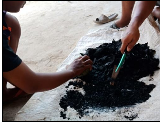
Figure 6. Documentation of the process of reducing the size with a hammer