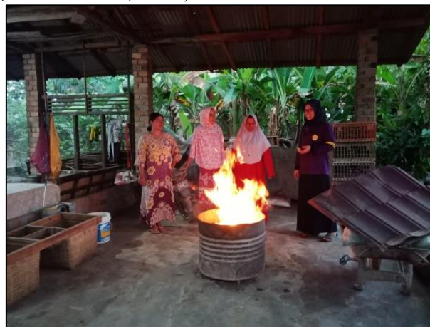
Figure 5. Documentation of coconut burning

The coconut shell burning process is carried out to produce shell charcoal by the carbonization method. This process is carried out for 8-10 hours and due to the thickness and hardness of the coconut shell, it takes time to become charcoal (Figure 5). The composing is done by the pyrolysis method or burning a little oxygen so that the coconut shell does not burn completely to ashes by leaving the carbon element. According to previous research that has been carried out, it shows that the pyrolysis process is carried out to remove the elements of hydrogen (H) and oxygen (O) to leave the element carbon (Tumbel et al. , 2019).