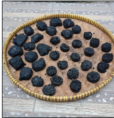
Figure 8. Biobriquettes drying process