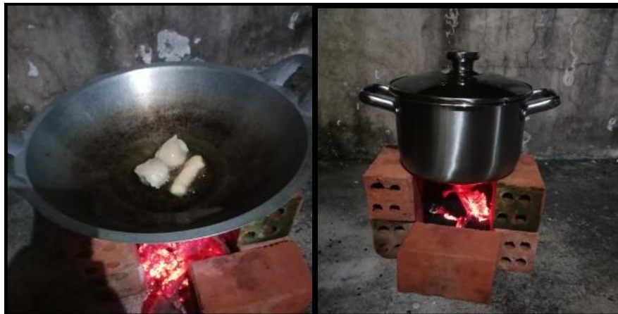
Figure 9. Cooking process by utilizing biobriquettes

After the biobriquettes production process is done. The biobriquettes are then ready for utilization such used for cooking, etc. As the result, the biobriquettes are then used by the local community groups to cook, boil and fry food such as Pempek as figured below (Figure 9).