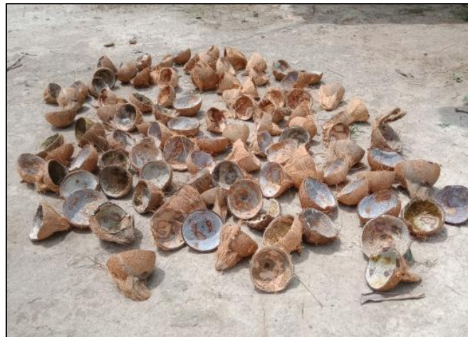
Figure 4. The coconut shell drying process