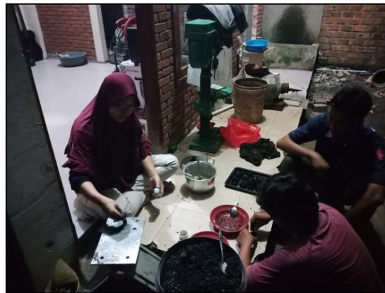
Figure 7. Biobriquettes pressworking process

After the size reduction process, the coconut shell charcoal was mixed with tapioca flour adhesive. Previously, tapioca flour was cooked with water until the texture resembled clear glue. After that, the mixing process is done in accordance with the composition ratio of 6 (charcoal): 1 (adhesive) which is then pressed using a cylindrical pipe with a diameter of 2 inches and a length of 3cm (Figure 7). The composition ratio of the charcoal to the adhesive is determined based on the texture of the biobriquettes dough formed so that it is easy to print. In addition, if the composition of charcoal is more than the adhesive material it can improve the quality of biobriquettes much better (Deglas and Fransiska, 2020).