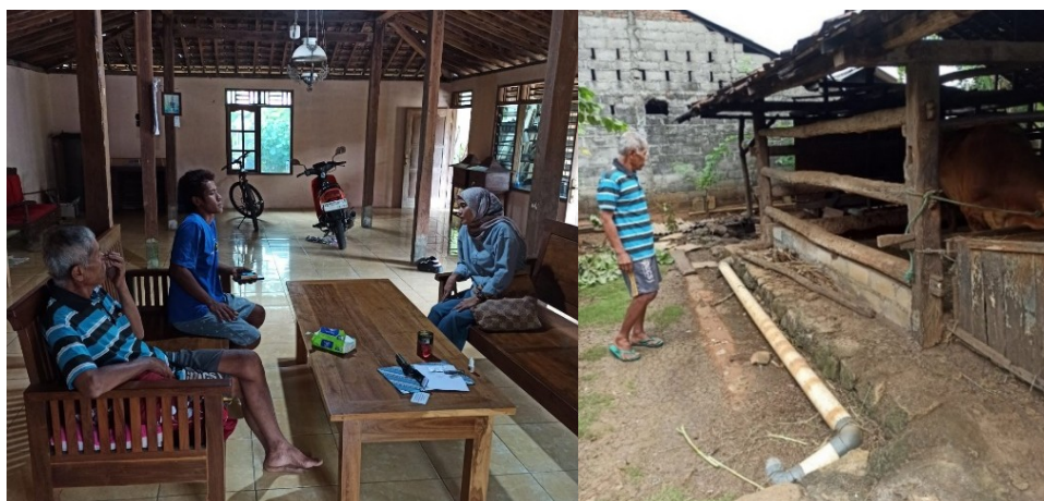
Figure 2. Coordination with land owners

as a means of community empowerment and strengthening collaboration among academics, village authorities, and local communities in supporting the implementation of biogas technology around Wanagama Forest.