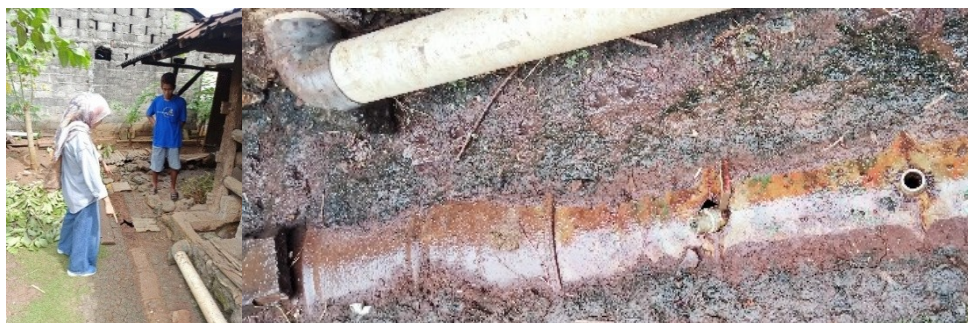
Figure 1. Condition of the rusty and damaged biogas digester