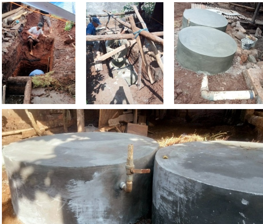
Figure 4. Construction of biogas installation

During the construction process, community members were actively involved in both physical activities and technical discussions, which enabled them to become not only beneficiaries but also to gain an understanding of the operational principles of the installation. On-site assistance was provided by the community service team to ensure that each stage of the construction process was carried out in accordance with the planned specifications and technical standards. The final outcome of this activity was the completion of a biogas installation that was fully constructed and ready for use. With the completion of this improvement process, the new biogas installation is expected to operate more optimally and to have greater durability compared to the previous system.