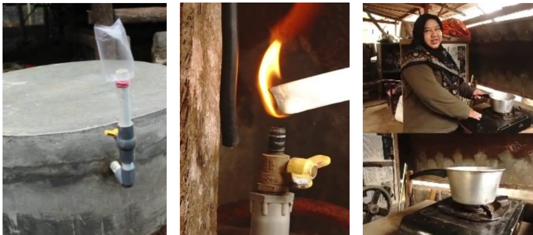
Figure 5. Biogas trial for cooking with a gas stove

Furthermore, a study [27] on household-scale digesters reported biogas production in the range of 0.018–0.024 m 3 per kilogram of fresh cow manure, which is highly comparable to the results obtained in this activity. These findings reinforce that the value of 0.02 m 3 /kg used in this community service program is consistent with the average empirical results observed in field applications. These findings highlight that improving process control and feedstock management is essential to enhance biogas productivity in community-based systems.