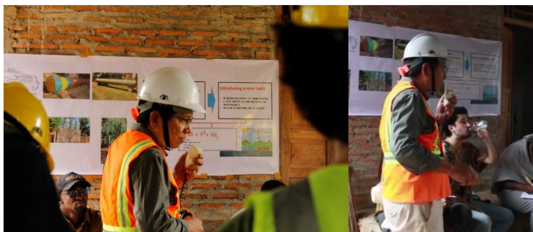
Figure 6. Education about green energy from biogas

appropriate technology in the fields of forestry and environmental management. These educational activities encouraged participants to understand the linkages among livestock waste management, forest conservation, and climate change mitigation through the use of clean energy. From these activities and other educational visits, the community members who owned the biogas installations also gained economic benefits through visits and training programs (educational packages) conducted in collaboration with Wanagama.