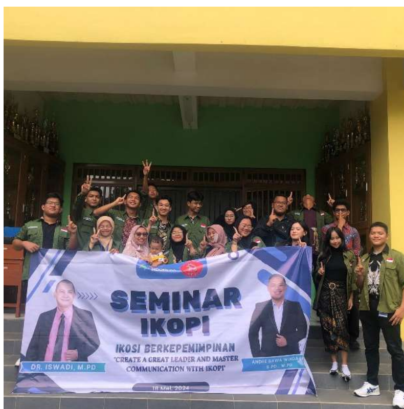
Figure 4. Implementation of seminar IKOPI