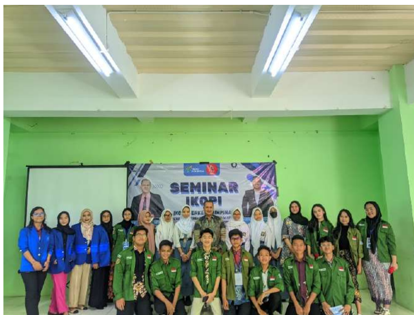
Figure 5. Documentation of Presenters, Participants and Committee

Once the material session is completed, various of questions and discussions with students takes place and takes a short time. Students ask about a variety of tips and tricks that can be applied so that they are able to establish effective communication, then wise ways so as not to be entangled in cases of communication ethics. For the remaining 30 minutes of time, the speaker answered the question in detail and ensured that participants understood everything they were conveyed. After all the questions were successfully answered, the seminar ended and closed with the taking of documentation with the participants and invitations that also enlivened. It is hoped that all these seminar events will be able to form leadership character in students and help in the development of human resources in the future [30].