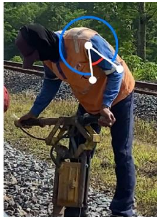
Figure 3. Posture and Angle of Leg