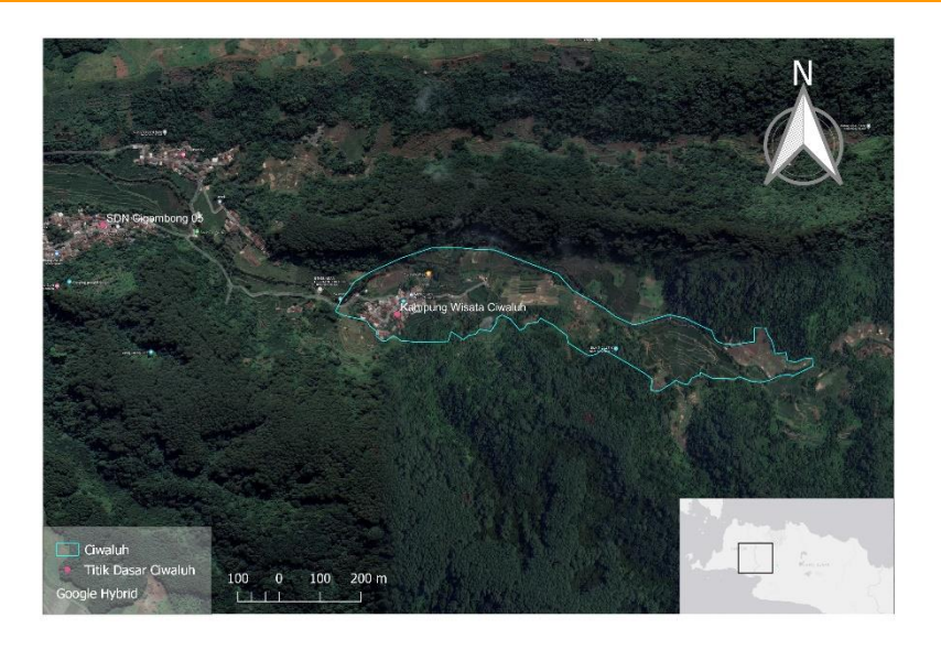
Figure 1. Location of Kampung Ciwaluh Tourism