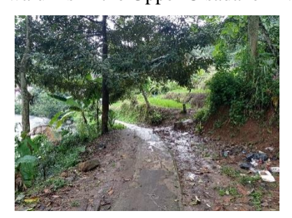
Figure 6. Access road to ciwaluh village which can only be passed by motorbike

viii. Access to tourism, (O) access to Kampung Ciwaluh can only be passed by motorized/two-wheeled vehicles because the public road is only 1-1.5 meters wide, so cars cannot enter. Visitors with groups using cars or buses must park their vehicles outside Kampung Ciwauh and then use motorbike taxis. With a system like this, Pokdarwis can empower the community to be involved as tourist motorcycle taxi drivers so that they can open new jobs. In 2023, road widening was carried out to facilitate the circulation of vehicles to Ciwaluh Village (Figure 6). Accessibility is the most important factor affecting the tourism experience and