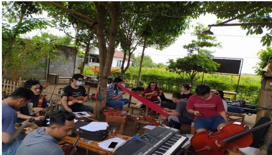
Fig. 2. The process of routine training carried out by members of the Pare String Ensemble community (Documentation: RR Maha Kalyana Mitta Anggoro)

The Universitas Negeri Surabaya Community Services team gone by the accomplice area (Pare String Ensemble) to see the condition of the community's action (schedule preparing prepare, etc.), as well as proceed coordination for the offline action program that was arranged at the starting. When the Universitas Negeri Surabaya Community Services team gone by the Pare String Ensemble area, it showed up that Pare String Ensemble individuals had begun to effectively carry out the schedule preparing handle, where individuals accumulated to hone together, bringing back their melodic instrument playing abilities. The taking after is documentation appearing the exercises of individuals of the Pare String Ensemble community amid the method of practicing together as show in Fig. 2.