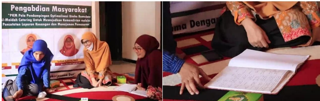
Fig. 1. Financial report recording training activities

Evaluation is carried out to ensure that the output of the training is in line with the partner's expectations. The results of the evaluation show that the implementation of the training has been proper with the field conditions and can help resolve the problems that have been facing by the partners, Figure 1 .