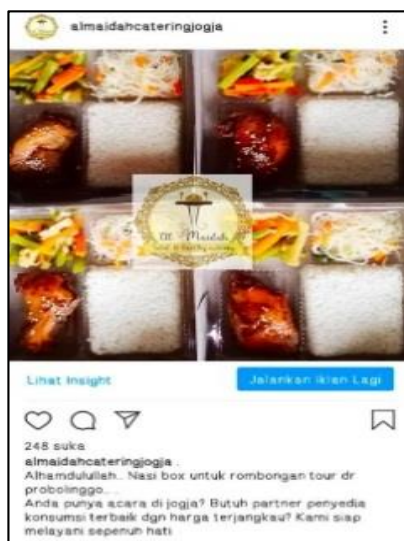
Fig. 2. Display of Marketing in IG Ads

The grant equipment purchased is supporting facilities of the catering business operational activities. The types of equipment purchased are as follows; (1) Packaging equipment; (2) Cafingdish; (3) Online promotion packages on IG Ads, Figure 2 .