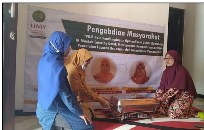
Fig. 3. Submission of Grant Equipment

Packaging equipment really supports the quality of the presentation and cleanliness of the catering. Packaging will also increase the selling value of the product because the appearance of the product is more attractive, thereby increasing partner performance. The purchase of Cafingdish supports partner accommodations in serving consumers. Meanwhile, the IG Ads online promotion package is very supportive of increasing partner brands and sales. Based on the evaluation results, the purchase of grant equipment greatly supports partners in improving the quality and capacity of their home businesses, Figure 3.