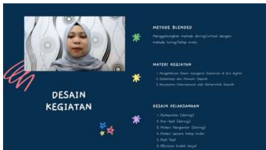
Fig. 3. Explanation regarding the design of the activity (Online)

In addition, identification of partners' prior knowledge related to the theme was also carried out. As many as 75 percent of participants did not know about government regulations related to the implementation of cooperation with foreign parties by local governments. However, all participants thought that having knowledge and skills related to the implementation of international cooperation for local government officials was important. After that, an explanation regarding the design of the activity was carried out through a video that had been prepared by the team, Figure 3 .