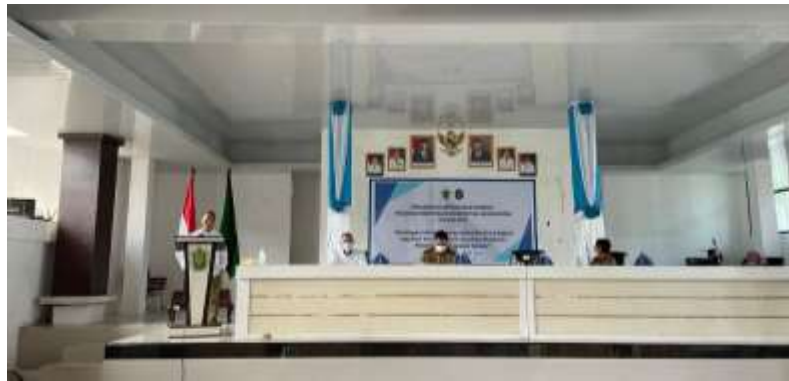
Fig. 4. Lectures and Interactive Discussion on Globalization and Regional Autonomy

The second stage of the implementation of the activity will be held on September 6, 2021 at the Takalar Regency Regent's Office. In this activity, material related to Globalization and Regional Autonomy was carried out. In this material, participants get an overview related to how globalization has changed the management of state administration, including in the aspect of relations between the center and the regions. Participants were given an explanation regarding the implications that must be faced by both Central and Regional Governments in facing globalization, Figure 4 , lectures and interactive discussion on globalization and regional autonomy. This material also explains historically the implementation of regional autonomy in post-reform Indonesia, which has decentralized the authority of the central government. The indicator of the achievement of this material is that participants can understand the basic concepts of globalization and regional autonomy and their impact on local governments.