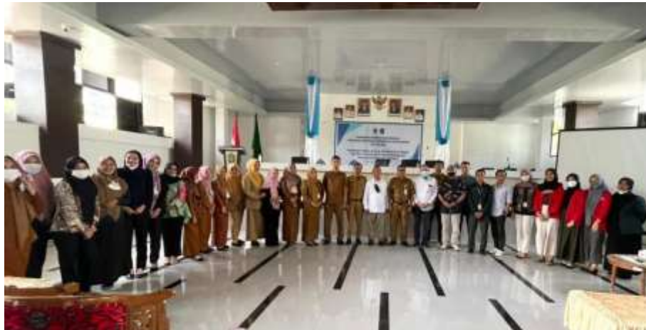
Fig. 6. Closing ceremony

local governments. In addition, participants also received an explanation regarding the stages that must be taken by local governments in carrying out cooperation with parties abroad. These stages are based on the Regulation of the Minister of Internal Affairs (Permendagri) Number 25 of 2020. After knowing the regulations and general stages. Participants then simulated the preparation of the Standard Operating Procedure (SOP) for the implementation of cooperation with foreign parties by the regional government. The achievement indicator of this activity is that participants can understand the regulations and stages in the preparation of cooperation with parties abroad by local governments. Figure 6 closing ceremony activity.