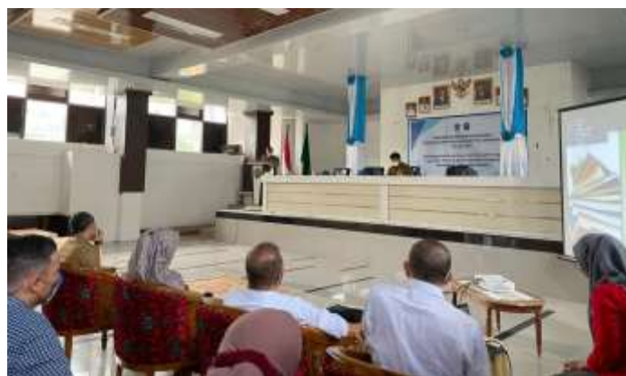
Fig. 5. Interactive Discussion and Simulation on Procedures for Implementing Local Government Cooperation with Institutions Abroad

The second material given is Diplomacy Transformation in the Digital Age. This material is an introduction to introduce the basic concepts of diplomacy and its changes in the digital era. In this material, participants gain an overview of diplomacy as an effort by the government to achieve its national interests. Participants gain knowledge regarding new actors and methods that emerge and affect the achievement of Indonesia's national interests in the digital era. The indicator of the achievement of this material is that participants can understand the impact of diplomatic transformation in the digital era for their role as local government staff, Figure 5 .