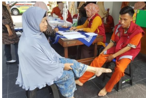
Fig. 6. Complementary Therapy

In addition to health checks in the form of a medical history, blood pressure checks, Temporary Blood Sugar, uric acid, height and weight checks, the service team also provides complementary therapy to partners. This complementary therapy is the application of acupressure points to treat hypertension, diabetes mellitus, gout, rheumatoid arthritis, and other acupressure points according to the partner's condition. The form of complementary therapy in the form of acupressure point applications can be seen in Fig. 6.