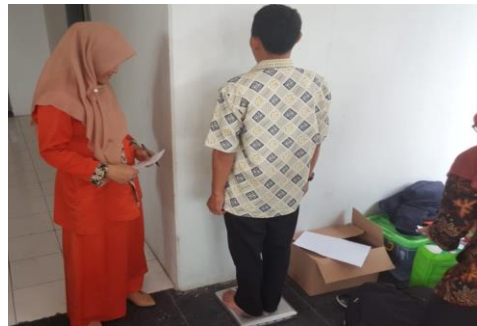
Fig. 5. Weight Check

The service team in addition to taking a health history, checking blood pressure, checking Temporary Blood Sugar, uric acid, and height, the next step is to check the partner's weight. Weight check activities can be seen in Fig. 5.