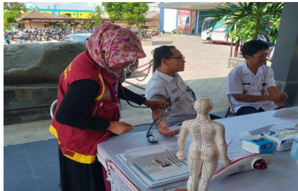
Fig. 2. Blood Pressure Check

Blood pressure is a very important factor in the human circulatory system [10]. Changes in blood pressure (increase or decrease) affect the balance or homeostasis of the body [11]. Stable or normal blood pressure will form a permanent driving force in the flow of arteries, arterioles, capillaries, and veins [12]. The community service team, in addition to taking anamnesis and checking blood pressure, also checked Temporary Blood Sugar and uric acid to determine the health condition of partners. The activity of checking Temporary Blood Sugar and uric acid can be seen in Fig. 3.