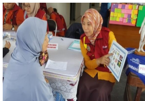
Fig. 7. Health Counseling

Complementary therapy is a complementary therapy that is widely developed in the world of nursing [19]. One type of complementary therapy is acupressure. Acupressure is used to improve circulation and reduce pain. Smooth blood circulation in the legs can reduce ischemia, angiopathy, and diabetic neuropathy. After the series of examinations were carried out, the community service team also provided health education to partners according to their health conditions. Health education activities can be seen in Fig. 7.