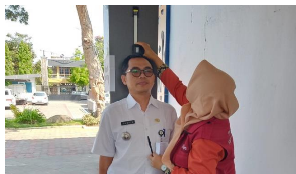
Fig. 4. Height Check

In addition to checking Temporary Blood Sugar, the service team also checked uric acid for partners. Uric acid examination is done to determine the level of uric acid in the blood or urine. Excessive uric acid in the body will form crystals in the joint area, causing joint inflammation or gout [16], [17]. After the service team checked Temporary Blood Sugar and uric acid, the next step was to do a height check. The height check activity can be seen in Fig. 4.