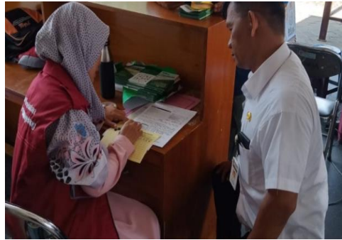
Fig. 8. Fitness Consultation

In addition to health checks, the service team also conducts fitness checks in the form of checking body fat, water content, muscle mass, physical value, calorie needs, cell age, bone mass, and belly fat. The fitness check and consultation activities can be seen in Fig. 8.