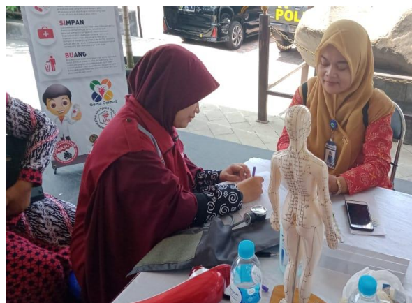
Fig. 1. Health History Anamnesis

The service team first took a history of the health of partners who checked their health in Muntilan Library and Archives Service, Magelang, Central Java. Anamnesis aims to collect data on partners' health and medical problems, so that they can identify the approximate diagnosis or medical problem faced by partners. In this anamnesis stage, the service team also asked about the identity of the partner in the form of name, age, address, and others. The health history activity can be seen in Fig. 1.