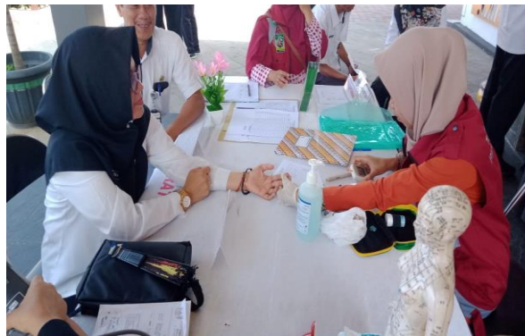
Fig. 3. Examination of Temporary Blood Sugar and Uric Acid

Blood pressure is a very important factor in the human circulatory system [10]. Changes in blood pressure (increase or decrease) affect the balance or homeostasis of the body [11]. Stable or normal blood pressure will form a permanent driving force in the flow of arteries, arterioles, capillaries, and veins [12]. The community service team, in addition to taking anamnesis and checking blood pressure, also checked Temporary Blood Sugar and uric acid to determine the health condition of partners. The activity of checking Temporary Blood Sugar and uric acid can be seen in Fig. 3.