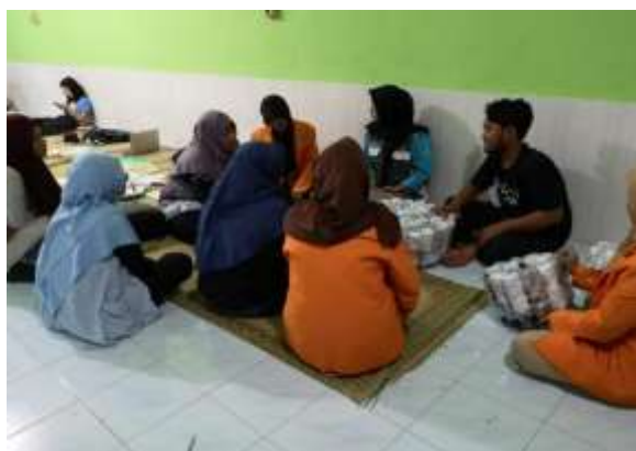
Fig. 1. Education and discussion about plastics waste and ecobrick

The results obtained from this service activity are participants' understanding of the types of plastic waste and their increased use. Plastic waste processing is the 3R, reducing, reusing, and recycling [10]. Participants were given the education to reduce plastic waste (Figure 1).