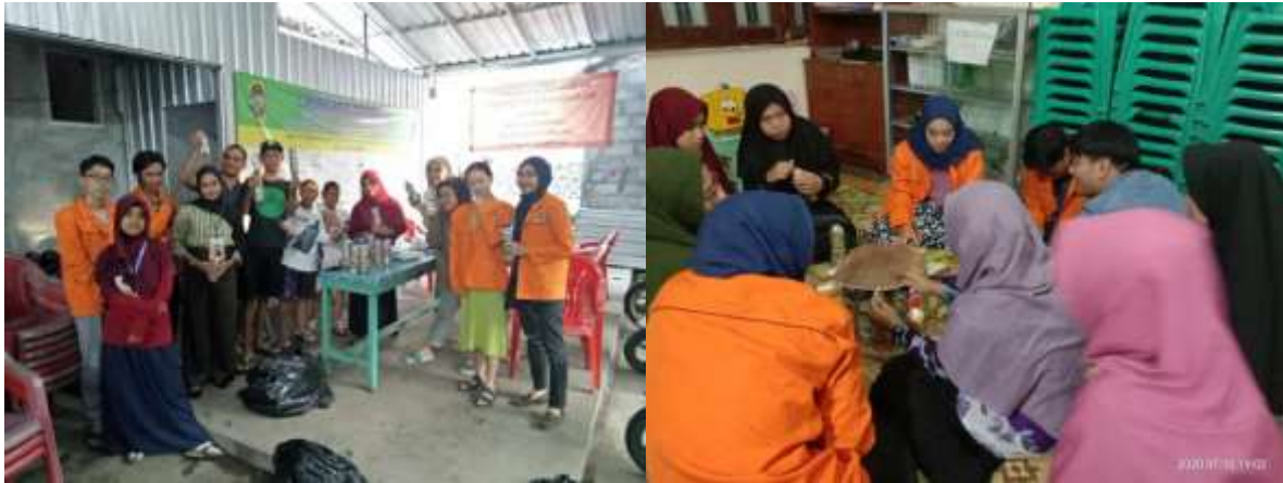
Fig. 2. (a) Training of making ecobrick; (b) Training of arrange ecobrick

For example, if you are shopping, bring a goodie bag from home. Do not use disposable drink bottles. Apart from reducing and reusing, they are also trained to recycle plastic waste. One way to recycle plastic waste is ecobricks. They said they were happy to be able to process waste into something useful (Figures 2 (a) and Figure 2 (b)). The training results are ecobricks in the form of shoe racks, tables and chairs to relax. This proceeds will be donated to RW 4,5,6 Notoprajan, Ngampilan, Yogyakarta.