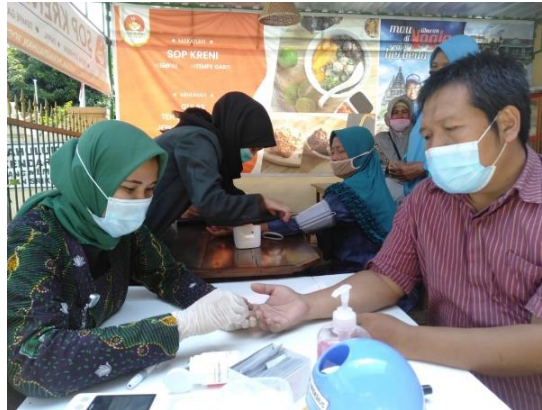
Fig. 1. Implementation of Hemoglobin Examination

Based on Fig. 1 hemoglobin examination procedure is :