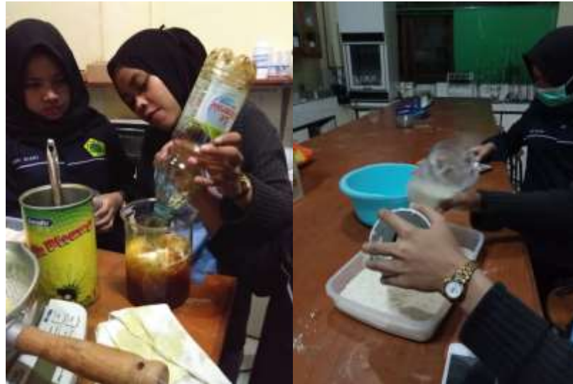
Fig. 1. Soap making trials

and also can be used as entrepreneurial ideas. After getting the best formulation and method, coordination was carried out with the students guardians of the Sabumi Homeschooling Community for Mentoring and Workshop on Making Bar Soap at the Kompleks Sariwangi Indah, Sariwangi, Bandung Barat.