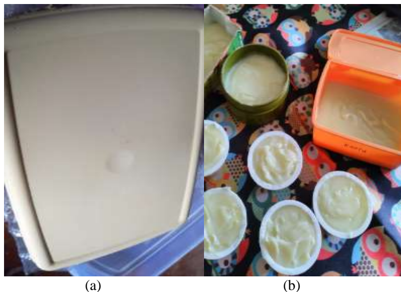
Fig. 5. (a) soap made from used cooking oil, (b) bar soap (made from palm oil and coconut oil)

Fig. 5 (a) is a soap made from waste cooking oil with a pH of 12. Fig. 5 (b) is a soap made by participants, from a mixture of palm oil and coconut oil. During the mentoring period, all participants were able to identify the curing process of the bar soap, and there were two participants who duplicated the process of making bar soap at home with their children.