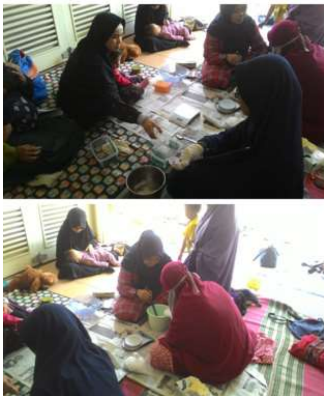
Fig. 4. Workshop process of Soap Making

Students' guardians of the Sabumi Homeschooling Community were very enthusiastic in this workshop, as presented in Fig. 4. They considered this workshop has detail procedures that were easy to duplicate and could be applied as teaching materials for children who are members of Sabumi Homeschooling. In addition, the students' guardian interested in running a bar soap souvenir business. This is a good idea for entrepreneurial opportunities, utilizing waste and save the environment from pollution.