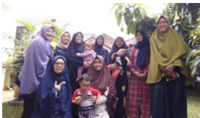
Fig. 7. Photo session of speakers and participants in bar soap making workshop