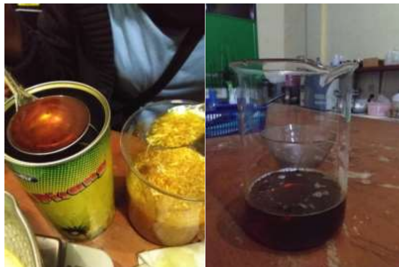
Fig. 2. Filtering process of used cooking oil with bagasse

The trials included the pre-treatment method of waste cooking oil. The waste cooking oil taken from household waste had a thick color and contains a lot of physical impurities, therefore it is needed to carry out pre-treatment to overcome this issue. The initial treatment of waste cooking oil used bagasse as a filter. Bagasse was obtained from the rest mills of ice cane traders [8], then it was cleaned, dried and cut. The smaller size of bagasse, increased the contact surface area and the adsorption capacity [9], which is more effective in pre-treatment process of waste cooking oil. The pre-treatment process of waste cooking oil is described in Fig. 2. Besides filtering physical impurities, bagasse can also absorb color [10], moisture content and free fatty acids from waste cooking oil [11], [12].