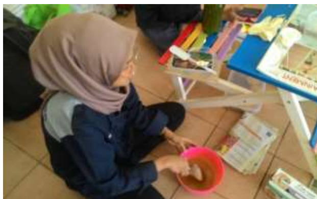
Fig. 3. Demonstration process of making solid soap from used cooking oil

longer duration (3-5 days of filtering and precipitation) [9]–[13], which could hamper workshop activities. Demonstration activities are presented in Fig. 3. After mentoring and demonstration of making soap with waste cooking oil as raw material, then the workshop participants practice making bar soap with a mixture of palm oil and coconut oil as raw materials. Palm oil is commonly used in making bar soap because it is inexpensive and easy to obtain. Adding coconut oil as a raw material is intended to add value on soap product. Based on its benefits, coconut oil has additional benefits as an antimicrobial [2] and skin softener [3]. Adding coconut oil as a mixture of raw materials was expected to obtain similar benefits, thereby increasing the advantage and selling value [14].