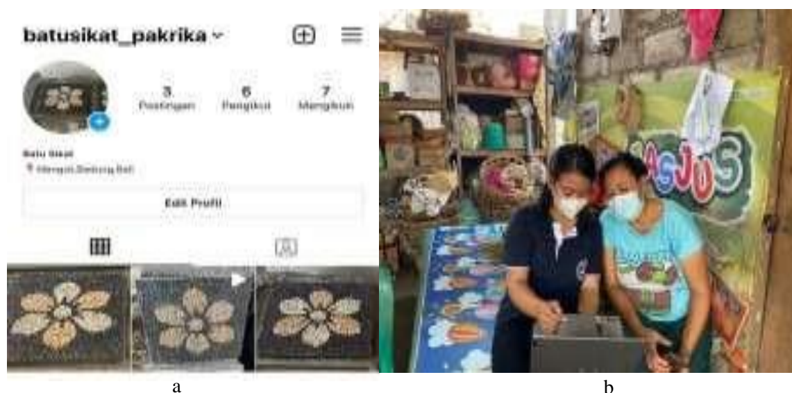
Fig. 1. (a) Making social media "instagram" to promote the Batu Sikat SME business in the Pererenan Traditional Village, (b) Training on the use of Instagram social media

Participation from the community in activities to increase innovation and digital marketing at Batu brush SMEs was well received by the parties concerned. Partners are very enthusiastic both in terms of attitude and seriousness in listening to things conveyed by the community service implementation team and feel helped by holding outreach activities about the use of social media to market SME products. The factors that support the success of this activity are the growing awareness and understanding of the use of social media in marketing a product in the current era, such as promoting through social media and innovating the latest products [6]. In its implementation, there are no obstacles that make it difficult to run this program. In the Figure 1 (a) and Figure 1 (b) showed that we made an account of social media for promoting the Batu Sikat SME business in the Pererenan Traditional Village and be a trainer for training how to use social media.