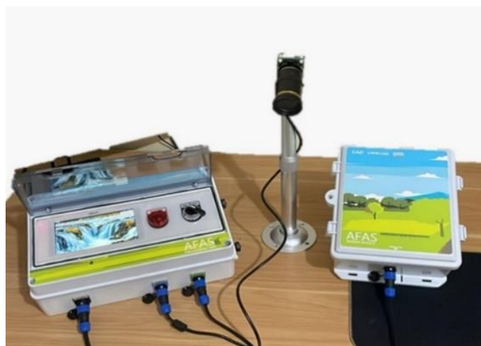
Fig. 3. AFAS Device

This module is connected to various environmental sensors, including temperature, humidity, light intensity (LUX), and rainfall sensors, and is powered by an Internet of Things (IoT) system that enables automated and remote monitoring and decision-making. The camera acts as a visual input for the AI algorithms, allowing for early detection of plant disease symptoms through image analysis. The combination of AI computing and the sensor system enables farmers to manage crop growth conditions with precision, efficiency, and adaptability to weather changes and pest or disease outbreaks. With its portable and user-friendly design, the device is built to be easily used by partner farmers in a community empowerment context and supports the transformation from conventional farming to data-driven digital agriculture. This implementation serves not only as a technological intervention, but also as a proof of concept and a participatory empowerment model for smallholder farmers. AFAS Device as show in Fig. 3.