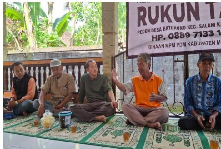
Fig. 2. Joint Training and Workshop

Farmers were given hands-on training on the concept of smart farming, an introduction to AFAS devices, and a simulation of crop monitoring through a dashboard interface. The training was delivered in stages using andragogical methods and field-based practice (learning by doing) to ensure effective knowledge transfer and practical understanding. Training and workshop as show in Fig. 2.