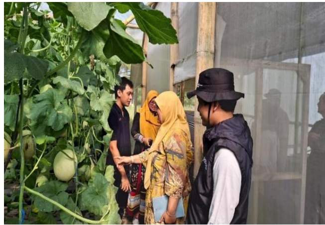
Fig. 4. Mentoring on AFAS Operation and Maintenance

The implementation of AFAS has driven a significant shift in farmers' work patterns from traditional approaches toward data-driven management. Farmers have begun adopting data-based decision-making, such as scheduling irrigation and fertilization based on information provided by the AFAS system. This reflects a transition toward more efficient and sustainable precision agriculture. To ensure the sustainability of the program, intensive training was provided to farmers so they could independently operate and maintain the AFAS system. In addition, local working groups were formed to support the system's day-to-day operations and maintenance. This sustainability strategy aligns with the empowerment approach used by P4S (Self-Reliant Agricultural and Rural Training Centers), which emphasizes the importance of training and mentoring in enhancing farmers' self-reliance.