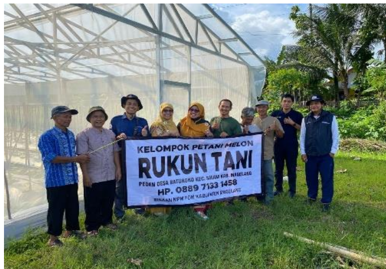
Fig. 1. Location of the plantation in Paden Baturuno, Salam Village, Magelang Regency