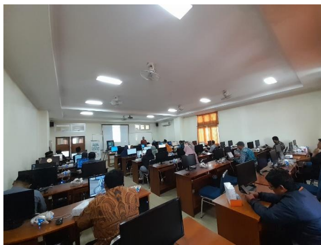
Fig. 3. Journalistic Training and Web Management Activities by MPI PWM DIY

The primary outcome of this training was the improvement of journalism and web management skills among the participants. Through the workshop approach, participants were given the opportunity to directly practice the theories they had learned. The training materials included Understanding Journalism Ethics and AIK Values, Assignments and Evaluation, Empowerment through Digital Media, and Development of Cooperation Networks. During the session on Understanding Journalism Ethics and AIK Values, participants were taught the importance of maintaining integrity and professionalism in every journalistic work produced. They were also introduced to the fundamental principles of journalism ethics, which include honesty, accuracy, independence, and social responsibility. The integration of AIK values serves as the foundation for every journalistic activity of the participants, making them journalists who are not only competent but also moral and ethical. Journalistic Training and Web Management Activities by MPI PWM DIY as show in Fig. 3.