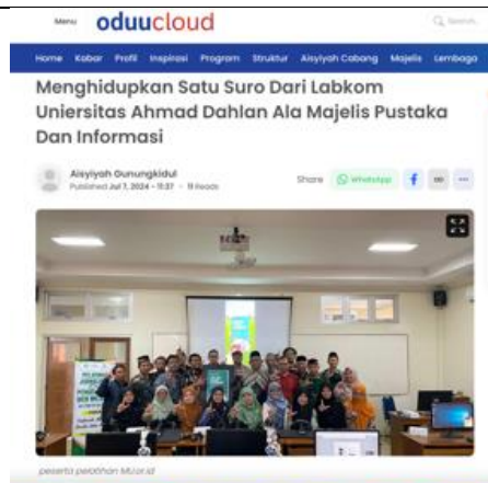
Table 1. The outcomes of the journalistic and web management training by MPI PWM DIY

https://aisyiyahgunungkidul.mu.or.id/menghidupkan-satu-suro-dari-labkom-uniersitas-ahmad-dahlan-ala-majelis-pustaka-dan-informasi