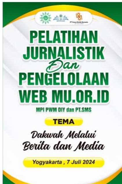
Fig. 1. Poster for journalistic training and web management by MPI PWM DIY

Muhammadiyah in the Special Region of Yogyakarta (MPI PWM DIY) recognizes the importance of journalists who are grounded in the values of Al-Islam and Muhammadiyah (AIK) in building an intelligent and integrity-driven society. As part of efforts to develop human resource capacity within the Muhammadiyah organization in Yogyakarta, MPI PWM DIY organized the "Journalistic and Web Management Training" program. This program is designed to equip Muhammadiyah cadres and administrators with strong journalistic skills integrated with AIK values. The primary goal of this activity is to produce young journalists capable of becoming agents of positive change in society, adhering to journalistic ethics and noble Islamic values. Poster for journalistic training and web management by MPI PWM DIY show in Fig. 1.