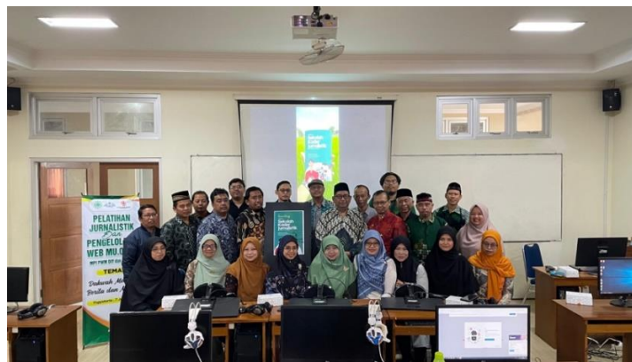
Fig. 4. After the activities, participants of the MPI PWM DIY journalistic and web management training

A special session on journalism ethics and AIK values provided an in-depth understanding of how these values can be applied in daily practice. Participants were invited to consider various ethical dilemmas that journalists might face and how they could make decisions aligned with AIK values. Additionally, participants were given real-life examples of how experienced journalists incorporate AIK values into their journalistic practices. This integration of AIK values not only equips participants to become competent journalists but also ensures they are moral and ethical in their professional conduct. After the activities, participants of the MPI PWM DIY journalistic and web management training as show in Fig. 4 .