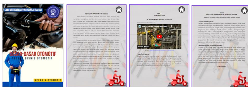
Figure 2. Project learning-based e-module model

The develop stage was carried out with automotive productive subject teachers at Muhammadiyah Sungai Bahar Vocational School. At this stage, researchers invited productive automotive teachers to provide assessments and corrections to the initial draft of the e-module that had been designed. Productive teachers provide input and corrections to the module content in the form of learning materials. The results of the development stage were then explained and revised in the final draft of the project learning-based e-module in automotive basics subjects, resulting in a project learning-based e-module model (Figure 2).