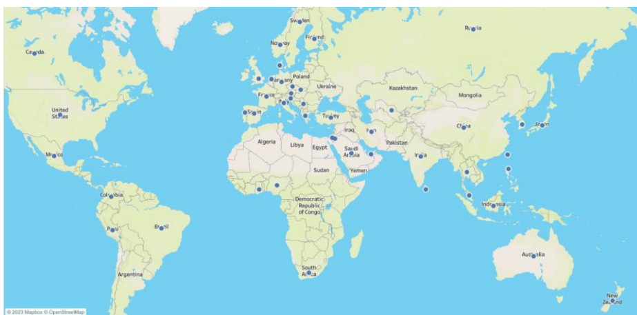
Fig 3: Article Distribution by Continent

The distribution of research on sustainability literacy across the top ten countries with the highest publication rates reflects diverse interests and commitments to this issue. The United States led in the first position with the highest number of publications, indicating a strong dedication and interest in conducting research on sustainability issues and sustainable development. Meanwhile, in second place was Indonesia, which also actively engaged in producing research and publications Mapping the Landscape of Sustainability ... (Destie & Mustika)