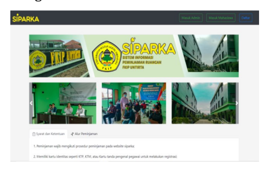
Figure 2. Main page view

The next stage of construction is the stage to create software by entering program codes into the code editor in accordance with the design modeling and databases that are needed and tested. In the process of developing the implementation of the coding structure of the website-based room loan information system using the sublime text 3 code editor.