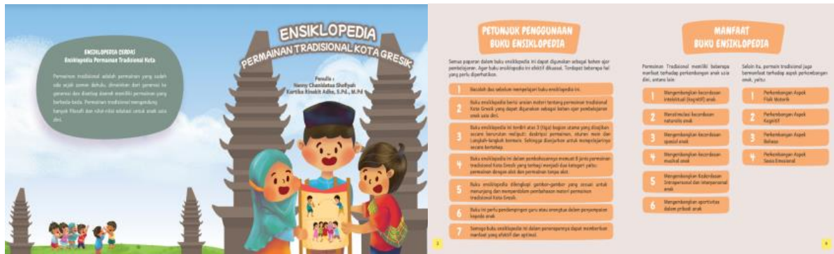
Fig. 2. Encyclopedia Book Product Design

Furthermore, the completed encyclopedia book is validated by material experts and media experts to obtain product feasibility. The results validation by material experts and media experts shown Table 3.