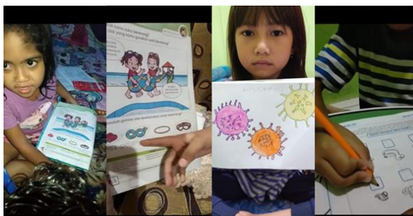
Figure 1. Documentation of children's learning outcomes sent via the Whatsapp application at TK Yapis V Perumnas I