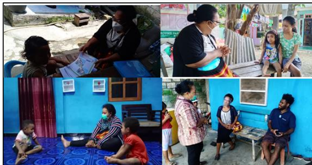
Figure 3. Home Visit Activity by Karya Kasih PAUD teacher

To monitor learning activities from home, parents send assignments via the Whatsapp application. The use of the Whatsapp application in addition to sending assignments is also used for synchronous learning or two-way learning. This is in line with the implementation of synchronous online learning carried out in other regions in Indonesia, WhatsApp being the most widely used application (Astuti & Harun, 2020; Botutihe et al., 2020). Learning in PAUD Karya Kasih also combines online and offline activities through home visits as shown in Figure 3.