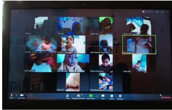
Figure 5. Use of the Zoom Meeting Application for distance learning at TK Aisyiyah Abepura

Judging from the features offered, this application is quite helpful in distance learning. This application can also bridge communication between teachers and parents. However, for early childhood, the use of this application, of course, must be accompanied by an adult.