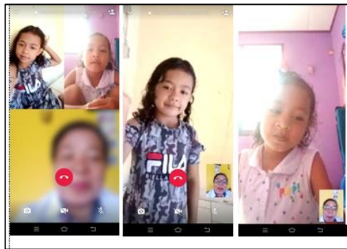
Figure 2. Utilization of the Whatsapp application for distance learning in PAUD Karya Kasih

in PAUD Karya Kasih is carried out by providing material by the teacher in the form of children's play programs/types of children's play which are periodically given to parents by taking the worksheet and submitting the evaluation in the form of documentation sent via the Whatsapp application as teacher assessment materials. This children's play program is similar to the children's worksheet (LKA). Once a week the parents take the children's play program and at that time the parents also submit the children's work that was assigned the previous week (Manggaprow, Personal Communication, 2020). To connect long-distance communication between teachers and students, the Whatsapp application is used as shown in Figure 2.