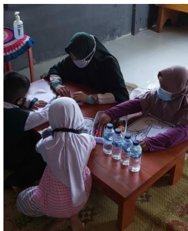
Figure 7. RA Al Asyrafii Arso Swakarsa's Home Visit Activity

The implementation of PJJ in TK Aisyiyah Bustanul Athfal is also not much different from previous PAUD institutions. In this institution, the distance learning process is also carried out by delivering materials or RPPM once a week. To monitor children's learning activities, learning is carried out through Vidio Call on the Whatsapp application (Muis, Personal Communication, 2020). Implementation of PJJ in early childhood at RA Al Asyrafy Asyaman Swakarsa Arso District was also carried out by giving worksheets by teachers to parents or guardians of students by communicating them through the WA application (Fatonah, Personal Communication, 2020). In addition to learning carried out by delivering LKA to parents, learning is also combined with home visit activities according to the health protocol during the pandemic as shown in Figure 7.