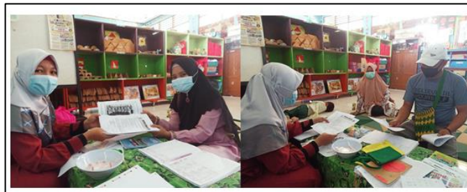
Figure 4. Taking LKA by parents at TK Aisyiyah Abepura institution

TK Aisyiyah is one of the PAUD institutions in the Abepura District, Jayapura City. At TK Aisyiyah, distance learning is carried out in the form of giving worksheets as in TK Yapis V and PAUD Karya Kasih. LKA is taken by the parents or guardians of students to school as shown in Figure 4. This form of LKA that is given to the parents of students is a way that is considered appropriate for distance learning in early childhood because children need assistance and guidance from adults, in this case, it is the student's parent or guardian. Because parents have different backgrounds in understanding educating and accompanying children's learning, the TK Aisyiyah institution also collaborates with a parenting program to support the implementation of distance learning for early childhood more optimally (Nurjayanti, Personal Communication, 2020).