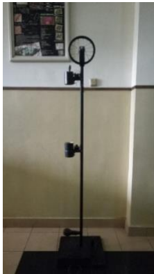
Figure 2. Atwood Tool Design