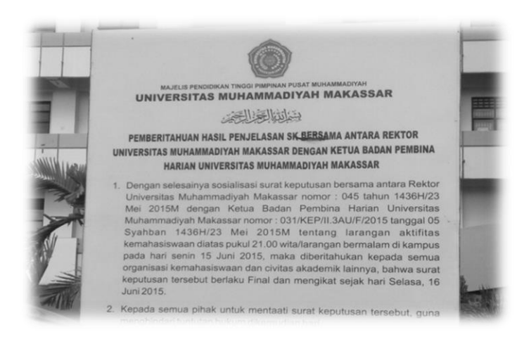
Figure 2. The Reflection of Islamic Value

The Islamic value is so reflected in the campus coming from manifestation of tauhid and faith. Each word should be line with faith. God has always been the main pointer in accomplishing the duty on the campus. Then, individual accountability emerges and feels that God will still see what we have carried out because He always watches us. An accountable individual brings organization into the visible realm that He has predetermined in the spiritual realm. If an individual maintains a great value of accountability in the performance, organization will reach the goal.