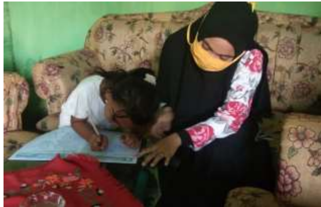
Figure 2. A Home Visit By The Teacher

on the lawn, washing hands after sweeping, and so on. Parents discuss with children about play activities to carry out. Children are free to choose which activity will play first this week. If the child is not interested in the activities carried out, the parents' role provides encouragement and encouragement. If the child wants other activities, the parents will follow the child's interest so LFH becomes fun. When learning activities occur, parents accompany and observe children and carry out documentation in the form of photos, voice recordings or video recordings of children's activities, including when children carry out routine and worship activities, then upload them to WhatsApp group as a record of children's development.