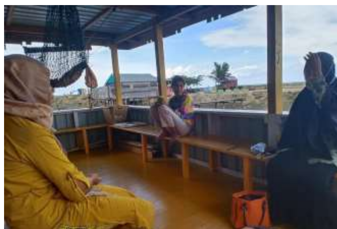
Figure 4. Discussion Between Teacher And Parents

Evaluation is a crucial stage because it provides information regarding the success rate of learning activities carried out. It is a process of collecting, analyzing, interpreting and making decisions about early childhood growth and development data in learning activities or service programs held in ECE. Evaluation can carry out in various ways and early childhood learning, both learning at school and LFH. Online learning conducted at kindergartens in Kendari City involves students' parents in evaluating at the end of the semester. By conducting an evaluation, the teacher can measure the child's ability through activities carried out at home in the form of pictures or photos, video recordings of children's work and performance sent by parents on WhatsApp group. The teacher assesses the development of students in collaboration with parents and conducts feedback and discussions with parents.