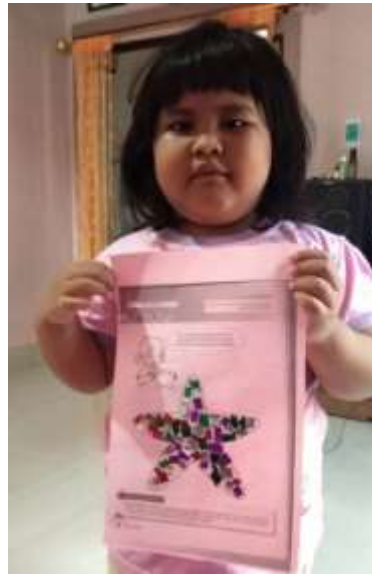
Figure 3. The Child Shows The Worksheet

teachers and parents can determine the development experienced by children and make it easier to monitor children's development in learning activities at home.