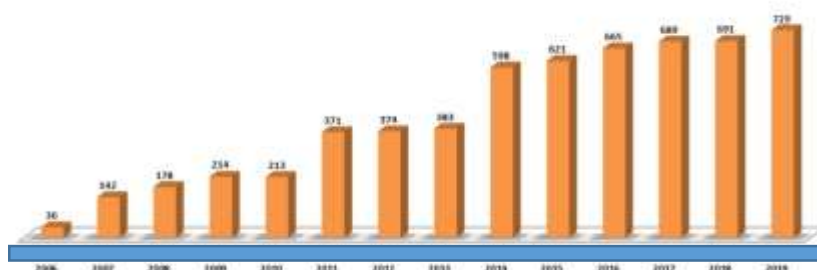
Figure 2. Number of Students of SD Unggulan Aisyiyah Bantul

From this statement, it can highlight that the school's image has an impact on increasing public trust of the school. It is proved by increasing the number of new student registrants at the school each year.