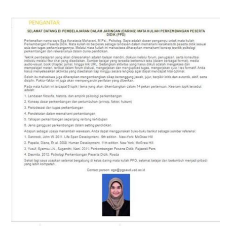
Figure 6. The Display of Student Development Course on the E-Learning Website

To maintain the quality of digital modules that are developed, as planned there needs to be a validation of experts who will assess the digital module on Student Development and Introduction to Biotechnology.