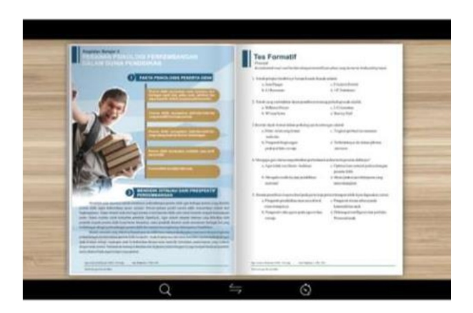
Figure 3. Digital Module of Student's Development Course

By using the Flip PDF Professional application, a Digital Module has been prepared for the students' development course. The modules that have been prepared are equipped with several learning videos so that the modules are more interesting and not monotonous. Display one of the pages in the digital module for student development course or abbreviated as PPD ( Perkembangan Peserta Didik ) is as follows.