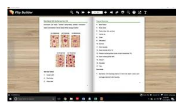
Figure 5. The Display of The Digital Module for Introduction to Biotechnology

By using the same application, a Digital Module for Introduction to Biotechnology Course has been prepared. The modules that have been developed are as follows.