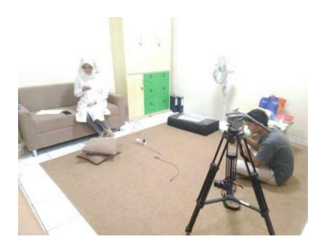
Figure 4. Taking Video For Student's Development Course Description

By using the same application, a Digital Module for Introduction to Biotechnology Course has been prepared. The modules that have been developed are as follows.