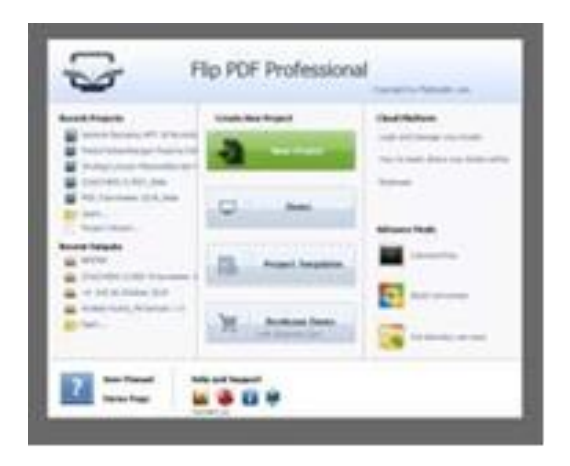
Figure 2. Flipbook PDF Professional Display