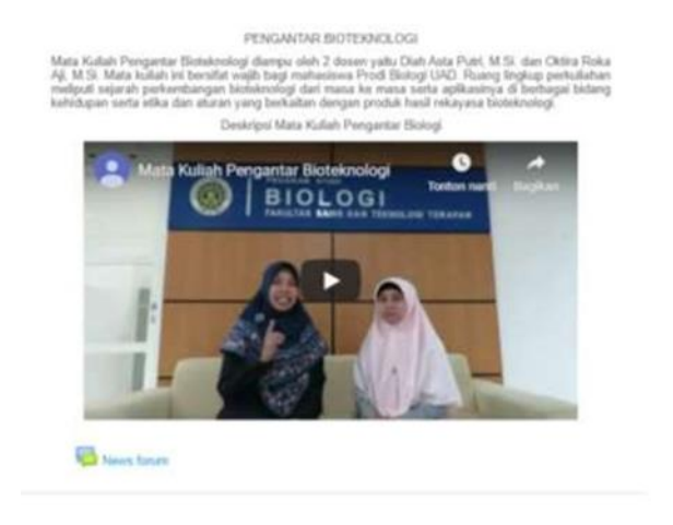
Figure 7. The Introduction to Biotechnology Course on the E-Learning Website

To maintain the quality of digital modules that are developed, as planned there needs to be a validation of experts who will assess the digital module on Student Development and Introduction to Biotechnology.