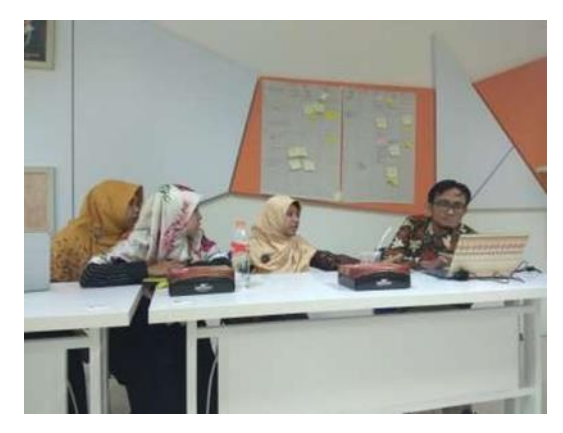
Figure 8. Validator Reviews the Prototypes

The results of validation in the Focused Group Discussion conducted, there are some input and suggestions from the validator shown in Table 4 as follows.