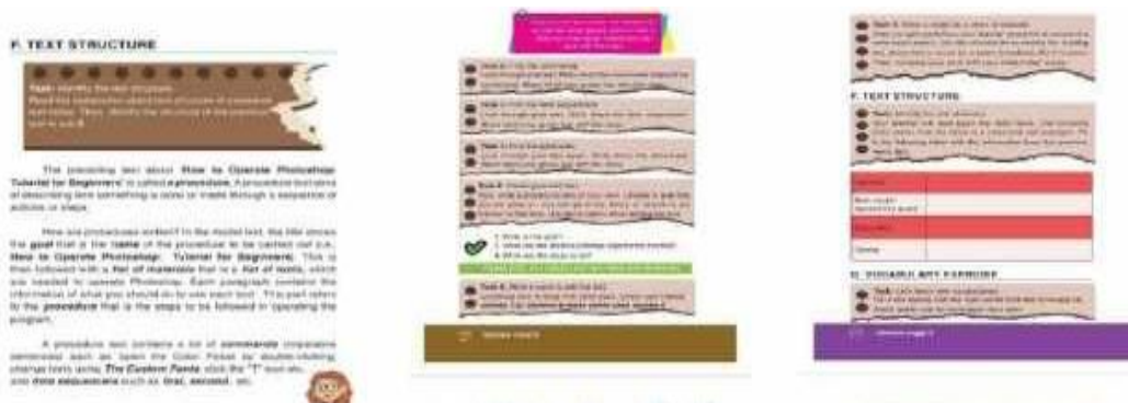
Fig. 4. Data of creativity

plays a crucial role in problem-solving and innovation across various domains, from science and technology to business and everyday decision-making. Thus, creativity is the process of generating ideas that are not only new but also have practical applications in society. Here is the data in Figure 4.