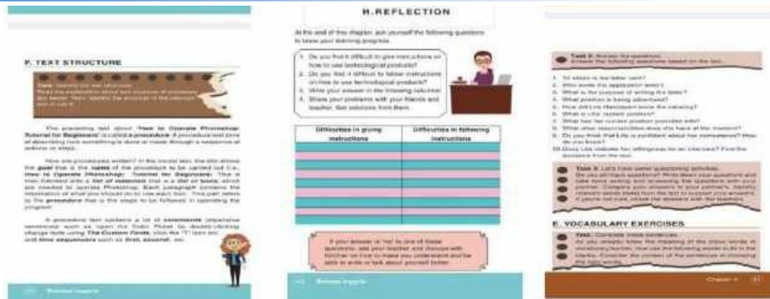
Fig. 3. Data of critical thinking.