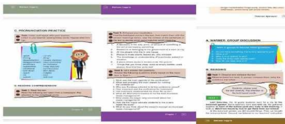
Fig. 2. Data of productivity and accountability.

exposed to real-life examples of how productivity and accountability function, as there's no better way to learn than through practical demonstration. It is hoped that the current generation will witness firsthand how productivity and accountability operate through these examples in Figure 2.