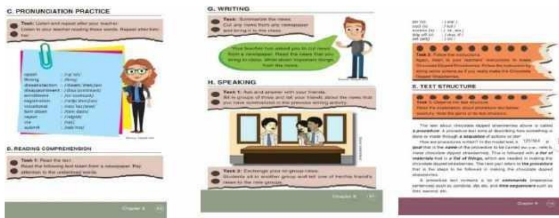
Fig. 6. Data of Flexibility and adaptability.

Flexibility and adaptability are essential qualities in effective teaching, enabling educators to cater to the varied needs of students. In educational contexts, "flexibility" and "adaptability" refer to the capacity to adjust, modify, or change one's thinking, approach, or behavior in response to evolving circumstances. These abilities empower individuals to navigate uncertainty, address challenges, and capitalize on opportunities effectively. Flexibility and adaptability are highly prized in personal, academic, and professional environments for their role in fostering resilience, problem-solving capabilities, and overall achievement. The data found in Figure 6.