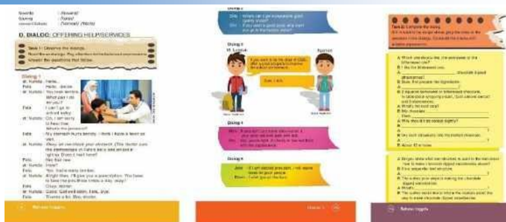
Fig. 1. Data of complex communication.

On page 40, it is suggested to display information or exchange ideas, such as presenting group discussion outcomes, to fulfill the criteria. This interpretation involves communicating through visual representation of group discussion results. Page 40 highlights the importance of visual tools in enhancing communication effectiveness. Utilizing visual aids like charts, diagrams, or group presentations improves understanding and fosters greater engagement (Zhang et al., 2020). This supports the suggestion to present information and group discussion results visually to bridge the gap in complex communication. Based on the conducted analysis, it was observed the following exchange of information or ideas in Chapter 1.