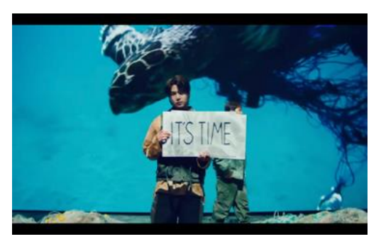
Fig. 2. The second index of the Samsung x BTS : Galaxy for the Planet ads (youtube.com/SamsungUS)