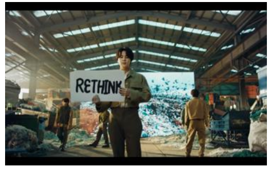
Fig. 3. The third index of the Samsung x BTS : Galaxy for the Planet ads