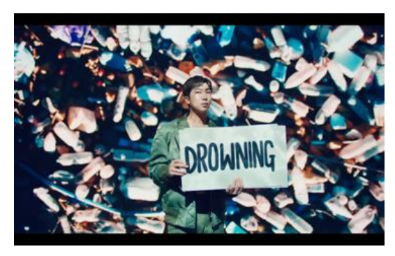
Fig. 1. The first index of the Samsung x BTS ad: Galaxy for the Planet ads

Index Index is a sign that is casual and has a connection to what it represents (Rizki et al., 2020). Having a relationship with an object that has cause and effect, or the result of a message (Fabianti & Putra, 2021). For example of indexical in the Samsung x BTS: Galaxy for the Planet advertisement are, in the first picture you can see the BTS member who is the leader of the group carrying a paper containing a message that the sea is full of plastic waste, besides that when he brings the paper there is also a screen behind him, in which describes the current condition of the ocean filled with plastic waste (pic no. 1). In the second picture, the rapper from the BTS group also carries a paper with a message that marine animals are being affected by plastic waste in the ocean, and on the screen there is a sea turtle entangled in fishing net garbage which is a bad impact for other animals too, not only sea turtles (pic no. 2). Then in the third picture, there is a vocalist from the BTS group who brings a paper with a message to rethink about the life of a product, by showing a video behind the screen there is product garbage piling up, most of what is shown is garbage that is just left piled up until trash to be recycled (pic no. 3). Everything that is displayed on the screen when the members bring paper with the message is the reality experienced by the earth as well as around the current environment.