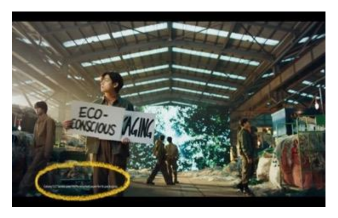
Fig. 6. The icon in the Samsung x BTS ad: Galaxy for the Planet (youtube.com/SamsungUS)