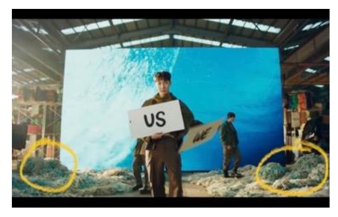
Fig. 4. The icon in the Samsung x BTS ad: Galaxy for the Planet (youtube.com/SamsungUS)

According to Representament (R), Interpretant (I), and Object (O) then, these ads can provide some understanding for the audience. Logically choosing the character of a brand ambassador also considers several aspects for the advertising model, namely, an attractiveness, expertise, and trustworthiness. In this case BTS has entered into all aspects to model an advertisement (Dweich et al., 2022).