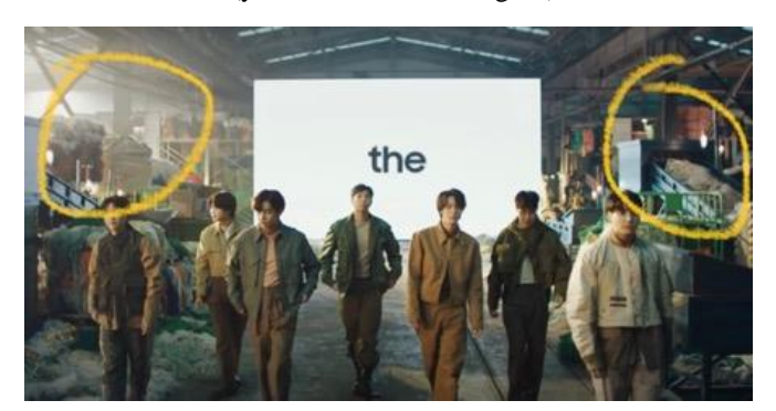
Fig. 5. The icon in the Samsung x BTS ad: Galaxy for the Planet (youtube.com/SamsungUS)