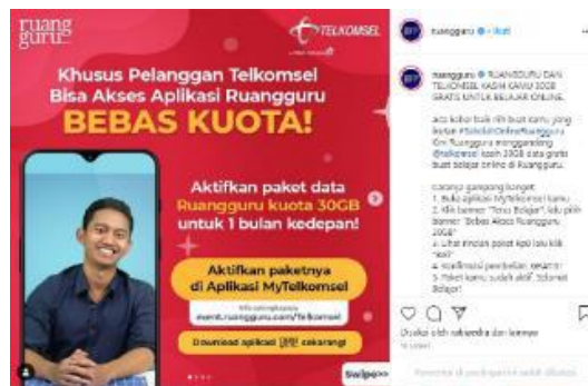
Fig. 3. Posting of Ruangguru (Instagram) giving Information about free quota to access Ruangguru

Kind of post in Figure 1 is information, it gives information about ruangguru's program corresponding to covid-19 which requires student to study at home (Setiawati, 2019). Ruangguru gives solution following the change that happens when learning method is accelerated from direct in person to indirect mediated by digital media. This program is accurately and quickly delivered through Instagram.