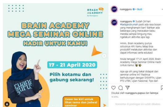
Fig. 4. Posting og Ruangguru (Instagram) with Caption corresponding to Covid-19 situation

Second is online communication, as mentioned previously other than the use of language and online language ability, this dimension is related to the quality of the medium used. There are two elements in Instagram post, which are photo or video and the caption used in the post (Randisa & Nurmandi, 2020). On social dimension, language utilization, especially in caption, is important because it can support the main message of the brand. The use of caption can be stronger if supporting social context related to the society, as mentioned before.