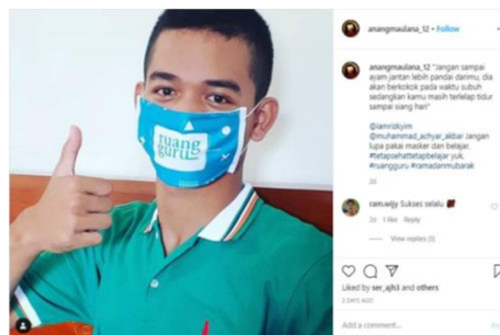
Fig. 5. Posting of @anangmaulana_12 (Instagram) joining the challenge from Ruangguru

The Take Action stage invites participants to take action or real action. Before Taking Action, the team carried out the Grab Attention and Engage stages. However, sometimes the participants' actions often stopped at that stage. Participants were still limited to being inspired or only inspiring other participants. To simplify the campaign objectives, actions for social change must be made easy.