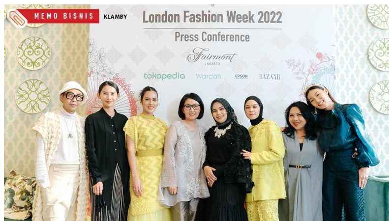
Fig. 2. Klamby Appears at London Fashion Week 2022

Wearing Klamby also succeeded in becoming the first Indonesian modest fashion brand to participate in London Fashion Week 2022. Wearing Klamby received support from various sponsors such as Tokopedia, Wardah, and Epson Indonesia. Apart from that, the Indonesian government through the Ministry of Tourism and Creative Economy, Ministry of Trade, and the Embassy of the Republic of Indonesia in London also provide support.