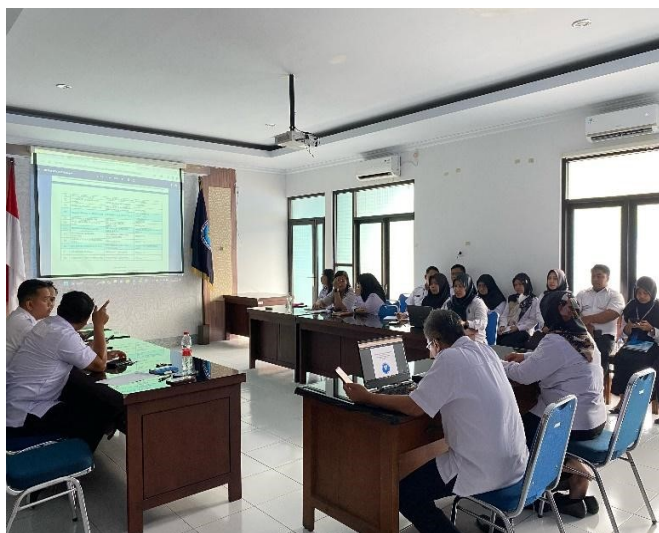
Fig. 5. Internal Meeting

continue to run with the existing cooperation or would be managed independently without coordination with BNNK Bantul.