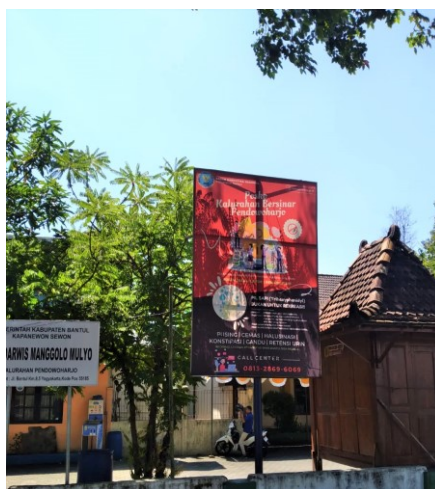
Fig. 3. Outdoor Media Source: Data from the field (2024)

In addition to using the whatsapp social media platform as a discussion space in the Desa Bersinar program, BNNK also utilizes Instagram social media to disseminate information about what activities are carried out and information about Prevention of Drug Abuse and Illicit Trafficking. However, in practice, Instagram social media accounts contain more content about activities carried out by BNNK Bantul and information content about Prevention of Drug Abuse and Illicit Trafficking so that content that is specifically about the activities of the Desa Bersinar program both in Pendowoharjo Village and in other villages is not found. Apart from using social media platforms, BNNK Bantul also conducts outdoor media communication in the form of installing billboards/banners containing information on Desa Bersinar in front of the Pendowoharjo Village office as part of outdoor media communication. Outdoor media communication in the form of billboards/banners makes it easier for people to receive information messages because they use easy language and attractive colors and designs (Takaeb, 2021).