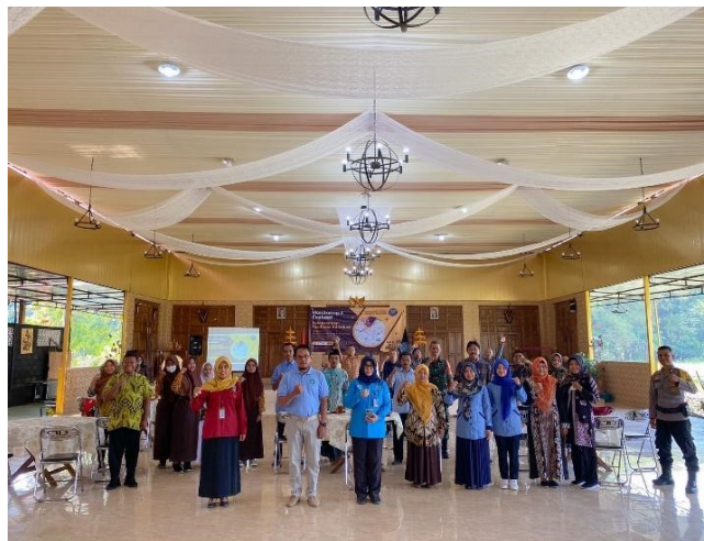
Fig. 4. Evaluation Meeting

The evaluation of the Desa Bersinar Program in Pendowoharjo Village is part of a series of activities of the Shining Village Program. In this evaluation, all representatives of the Pendowoharjo Village community were present, including from the Dukuh to the Village Head or Lurah , as well as the Regional Secretary (Sekda) of Bantul Regency and the Bersinar(Bersih Narkoba) Youth. The main focus of this evaluation was the performance and cooperation between the Bantul Regency National Narcotics Agency (BNNK) and Pendowoharjo Village, from coordination meetings to the implementation of the Desa Bersinar program activities. The performance that has been carried out during the one-year implementation of the Desa Bersinar program has been quite satisfactory. All working groups ( pokja ) have worked optimally even though there is still ineffective communication. Communication that is still not optimal is that there is still horizontal and vertical miss-communication. Miss communication with the village and BNNK as well as with the community.