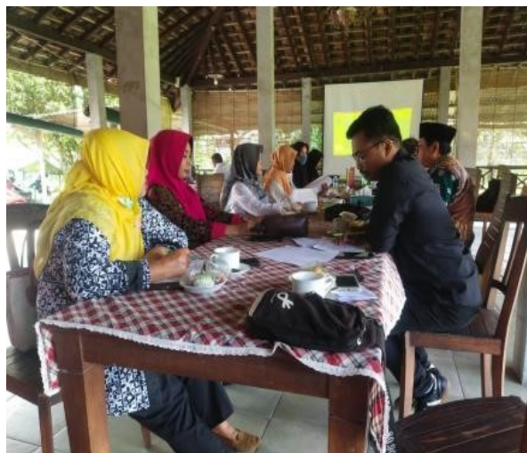
Fig. 2. Assistance Meeting

The Desa Bersinar program is carried out according to the event that has been determined by BNNK Bantul and Pendowoharjo Village. Activities that have been carried out include the Coordination Meeting of BNNK Bantul with the Pendowoharjo Village, the Assistance Meeting of BNNK Bantul with the Pendowoharjo Village, Technical Guidance and advocacy for 3 days BNNK Bantul with elements of the Pendowoharjo Village community, the Inauguration of the Desa Bersinar, Evaluation and Monitoring. In addition to conducting a coordination meeting with the village, the community counseling and prevention section of BNNK Bantul reviewed and conducted socialization in Pendowoharjo Village with the initial target of employees and visitors to Pendowoharjo Village with the aim of being the first step before the inauguration of Pendowoharjo Village as a Desa Bersinar. The coordination meeting aims to adjust the division of tasks of each employee in the relevant agencies, namely BNNK Bantul and Pendowoharjo Village. The coordination meeting was attended by BNNK Bantul staff and representatives of Pendowoharjo Village. This is also to minimize any miscommunication in carrying out tasks when it has been inaugurated as a Desa Bersinar.