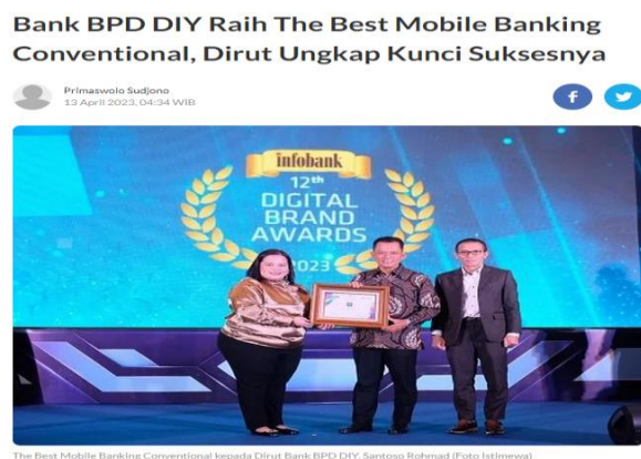
Fig. 2. Bank BPD DIY Award as The Best Conventional Mobile Banking