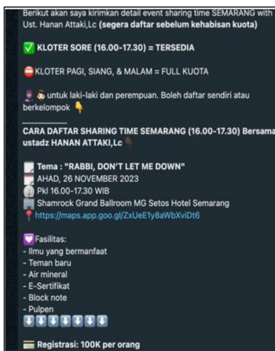
Fig. 3. The reply of a message from one of the contacts Ayah Amanah Event Organizer in the Semarang city batch