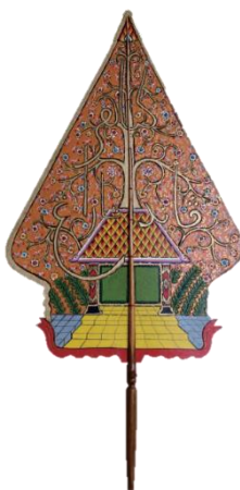
Fig 1. Wayang Kekayon Khalifah lakon Kiyai Pandanarang