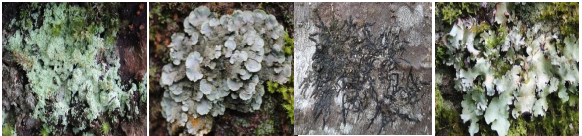
Fig. 6. Lepraria caesioalba