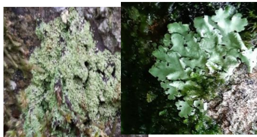
Fig. 10. Psilolechia lucida