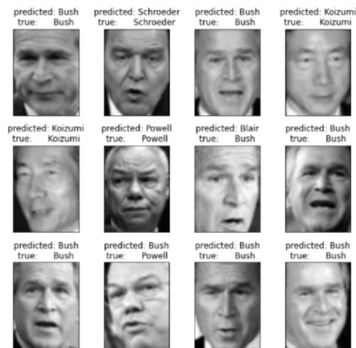
Figure 1. Face Classification Target

the data, there are 8 face classification classes, including: {'Ariel Sharon', 'Colin Powell', 'Donald Rumsfeld', 'George W Bush', 'Gerhard Schroeder', 'Hugo Chavez', 'Junichiro Koizumi', 'Tony Blair'}. The class of the face recognition of the data is shown in Figure 1.